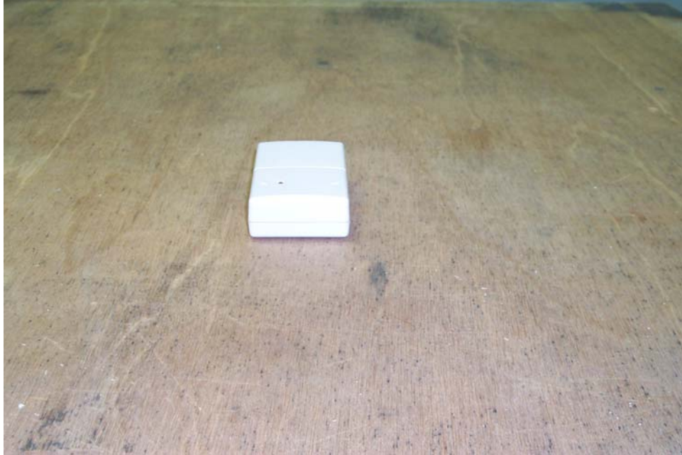
Radiated Test Setup, Position 1-X