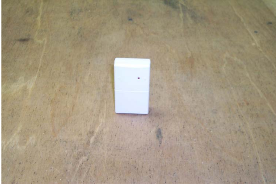
Radiated Test Setup, Position 3-Z