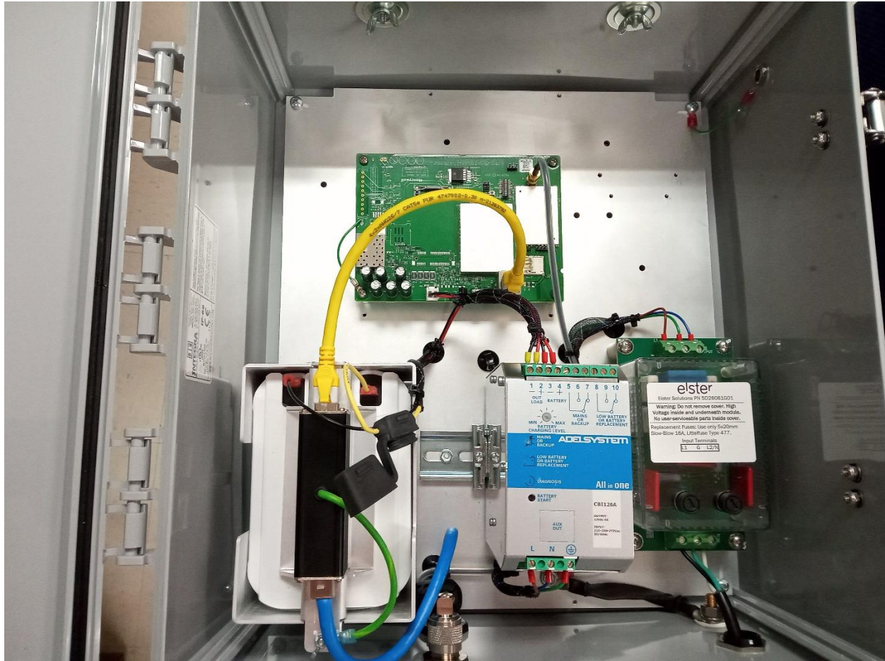
SNRGK4 as installed in host