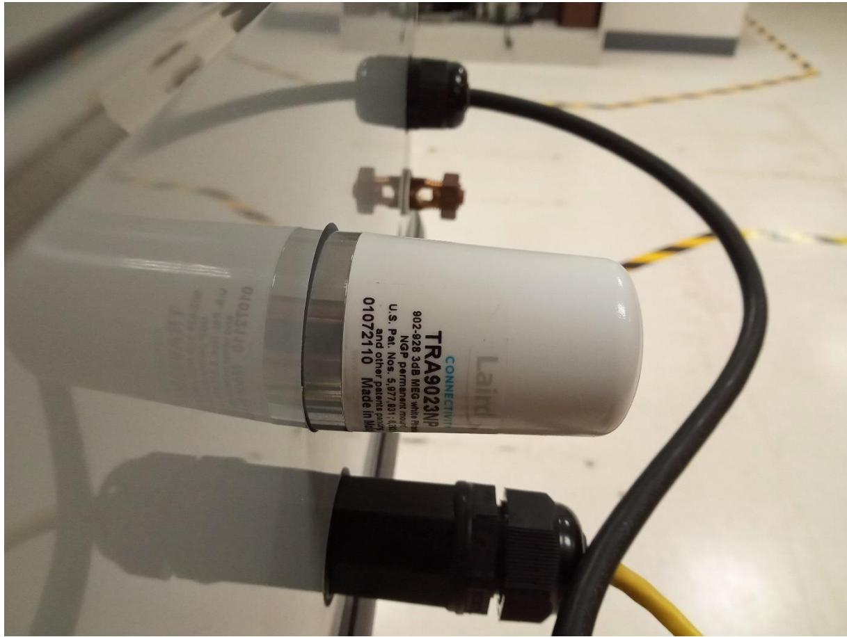
SNRGK4 900MHz antenna as installed on host