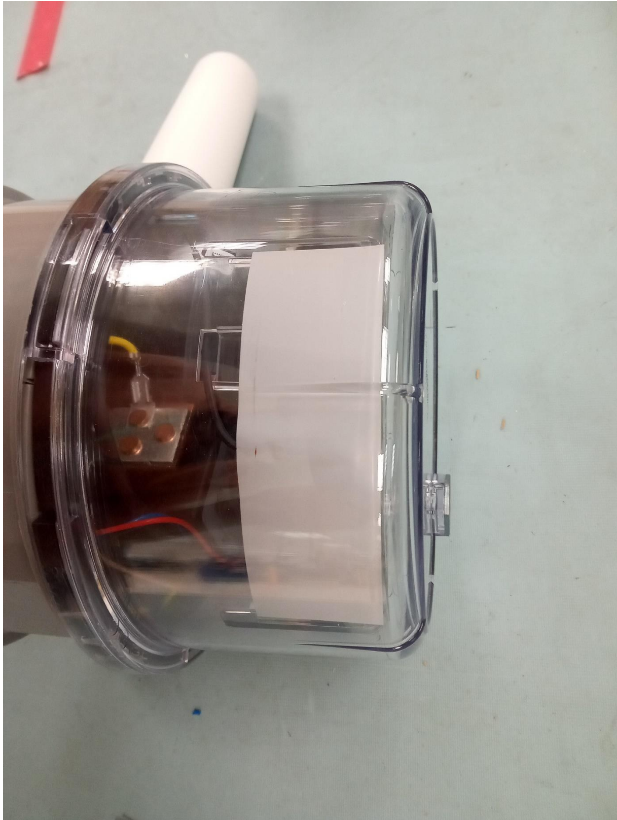
A4MGK4 900MHz flex antenna mounted on A4 host, shown against a clear housing for clarity of placement