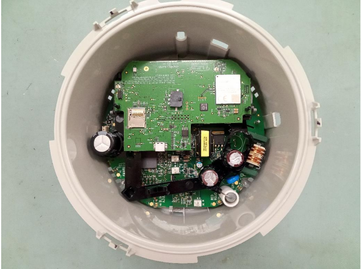
A4MGK4 as installed in A4 meter host