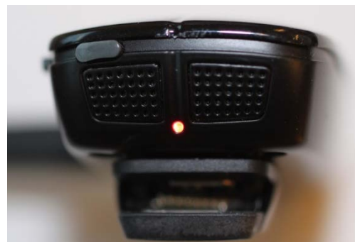
Top view – Charging LED ON