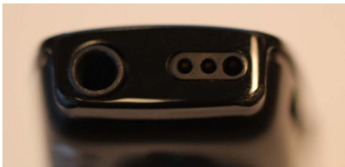
Bottom view (Left: line-in - right: FM/EURO Pin connector) LED ON .