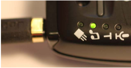
Line-in LED ON