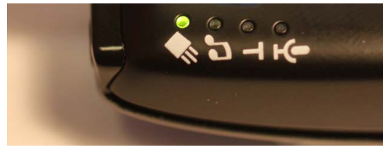
FM LED ON