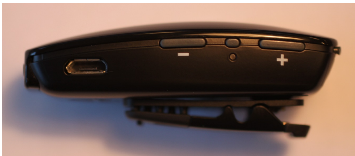
Right side view. (Micro USB, Volume down, Mute button/LED, Volume up)