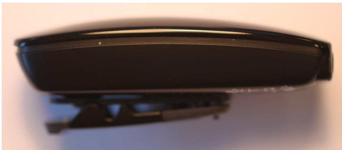
Left side view.