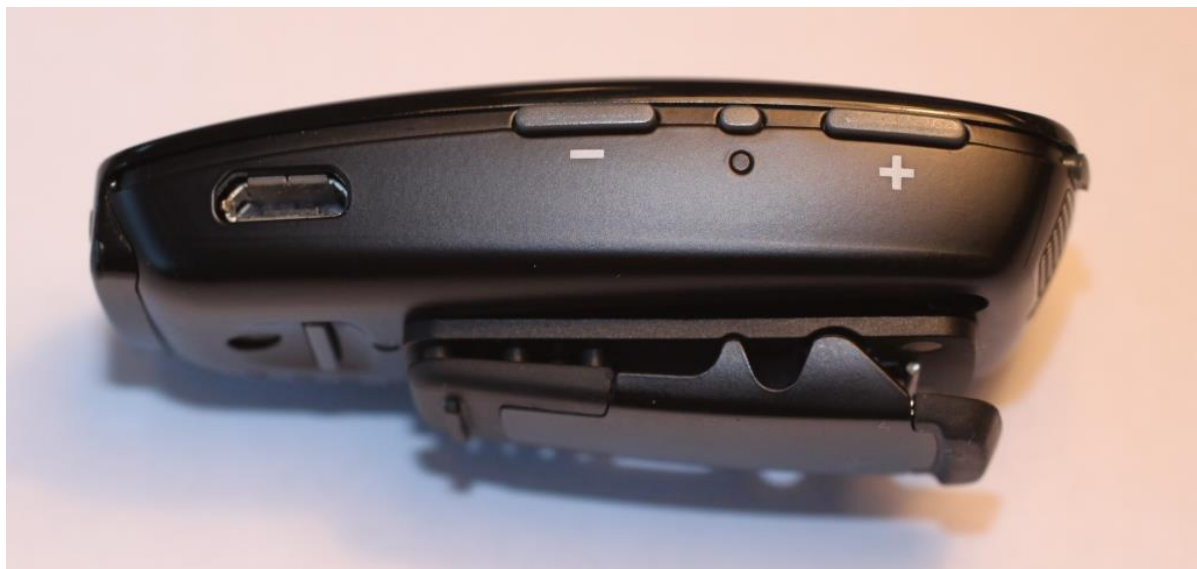
Back side – Clip design