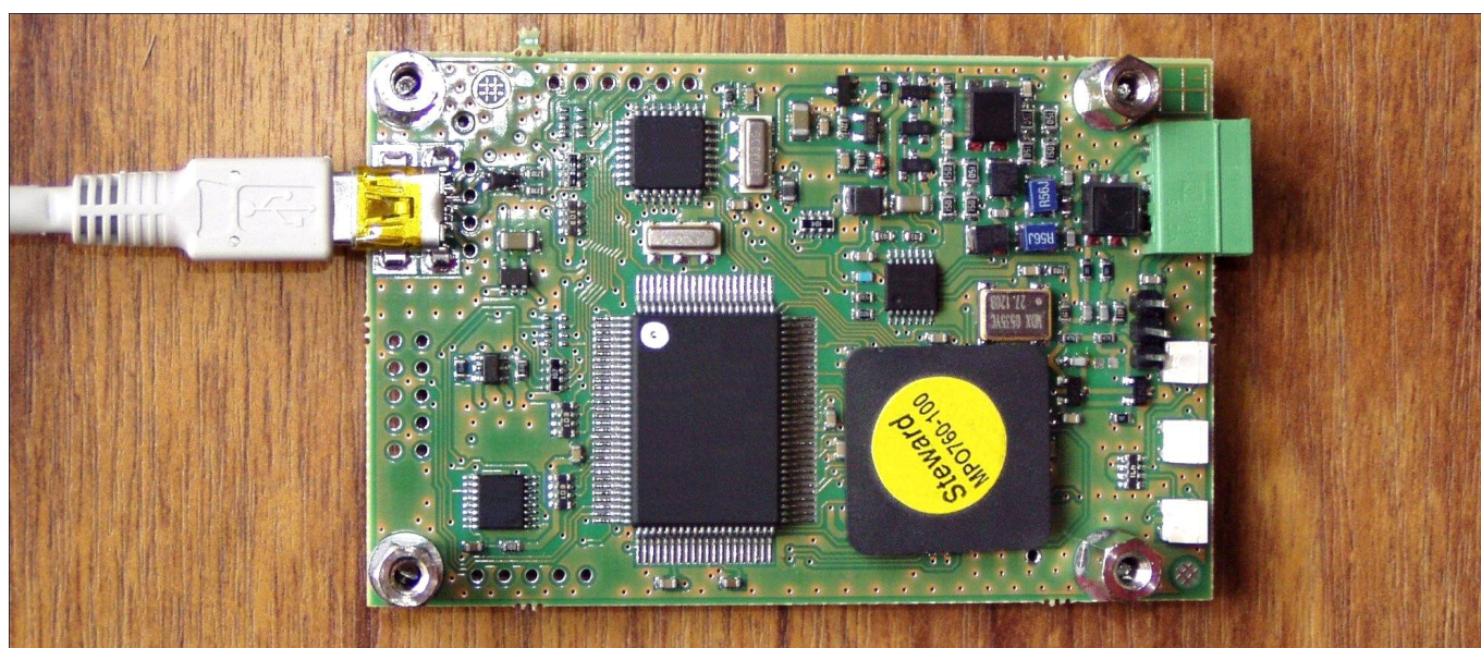
PCB view with ferrite square stuck on FPGA chip