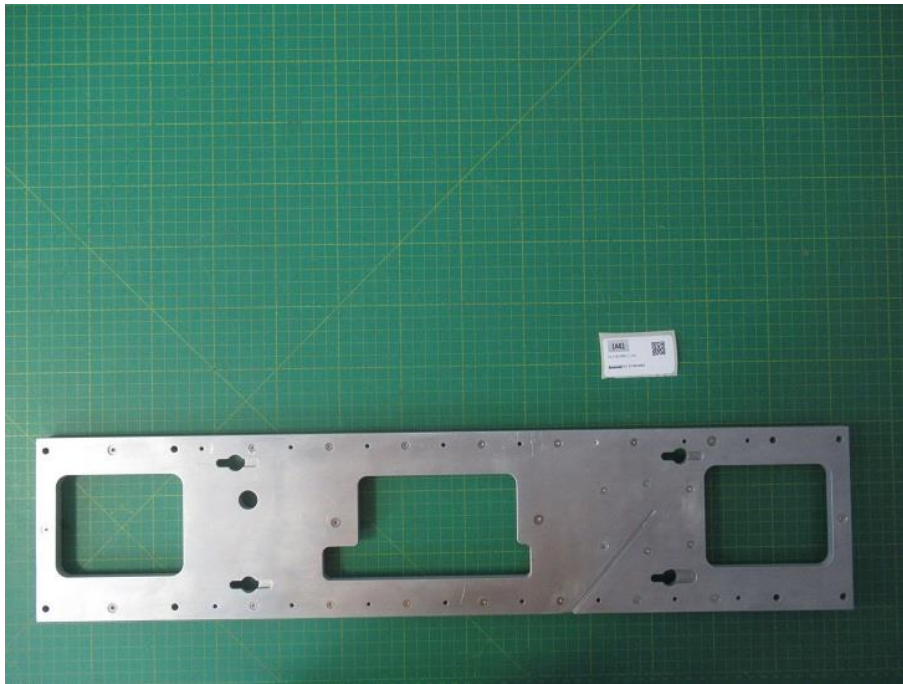
Photograph 3 : AE 1 - Front Metal Ground Plate