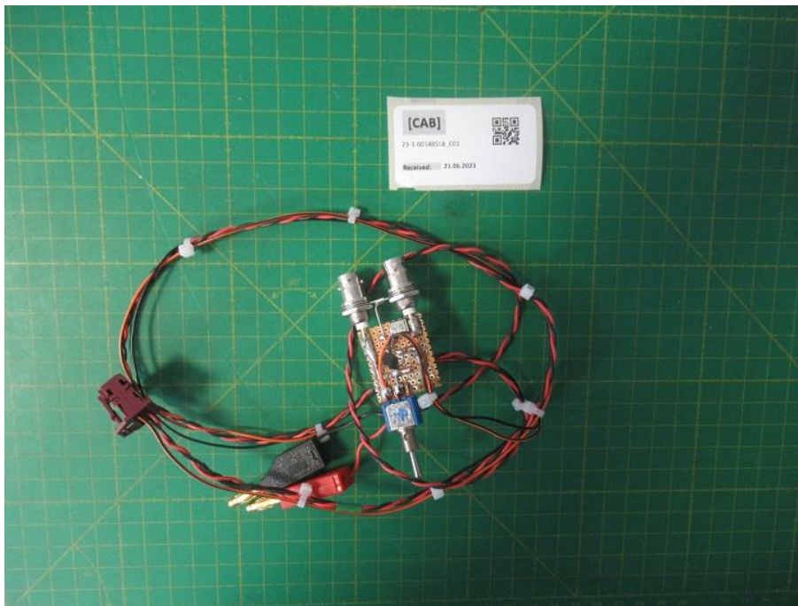
Photograph 6 : CAB 1. - Front Inverter PCB