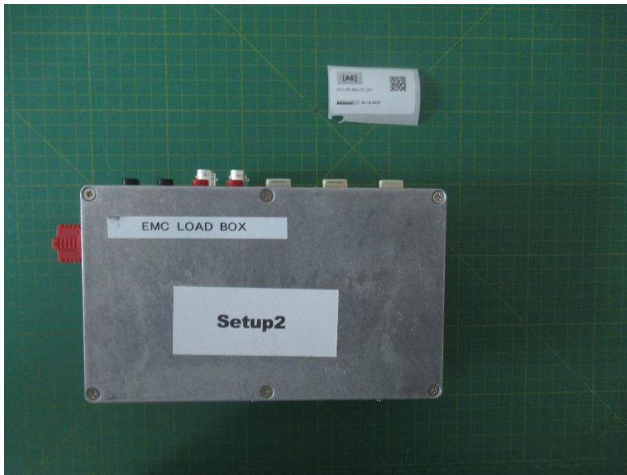
Photograph 5 : AE 3 - Front Power supply