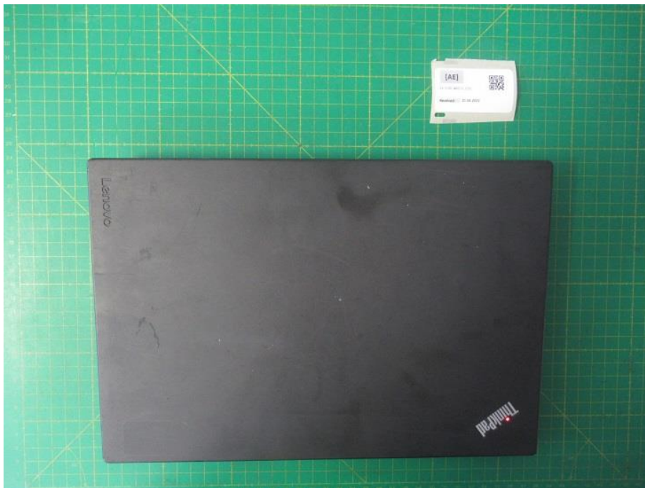
Photograph 4 : AE 2 - Front Laptop