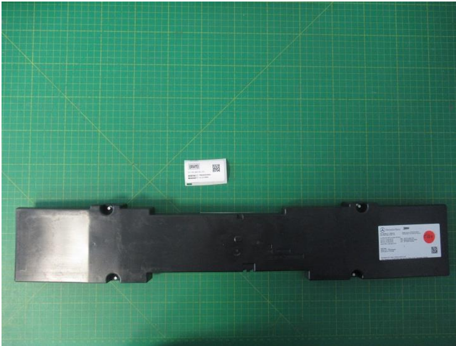
Photograph 1 : EUT – front side