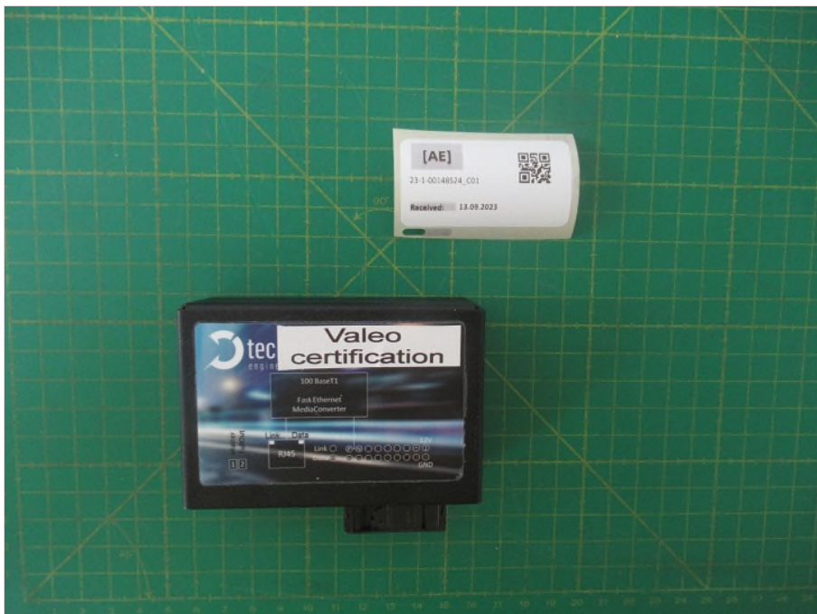
Photograph 4: AE 2