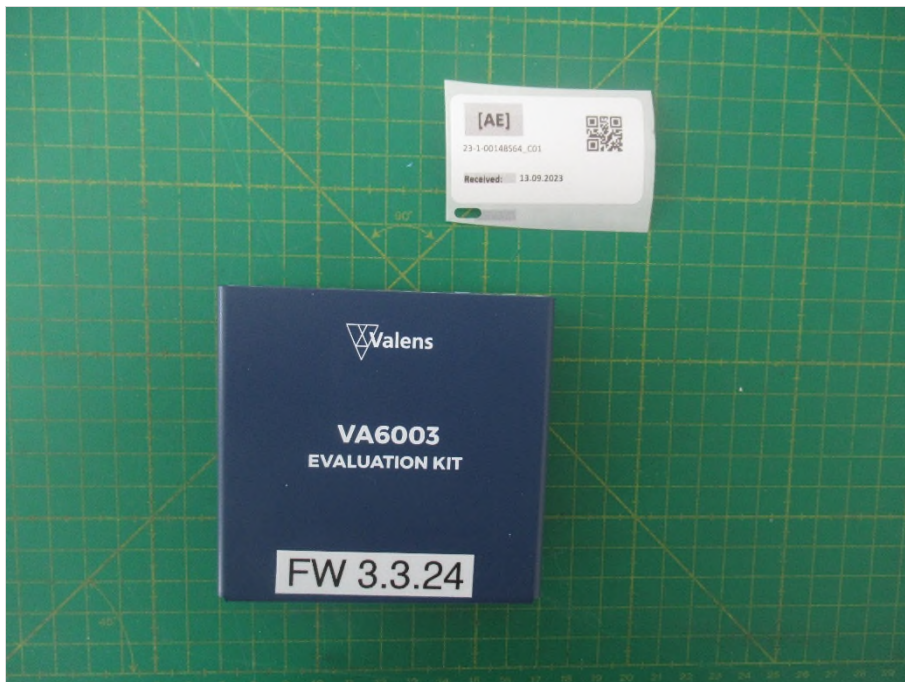
Photograph 7: AE 5