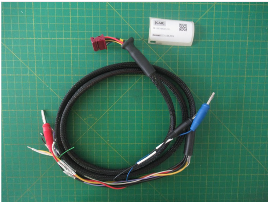
Photograph 8: CAB 1