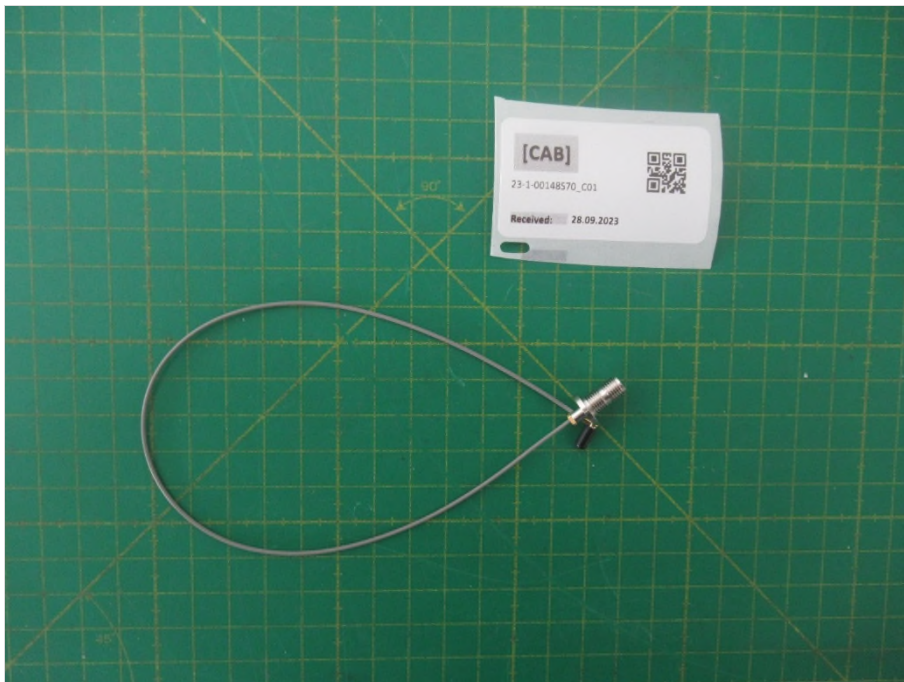
Photograph 10: CAB 3