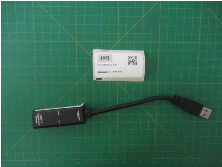
Photograph 3:AE 1