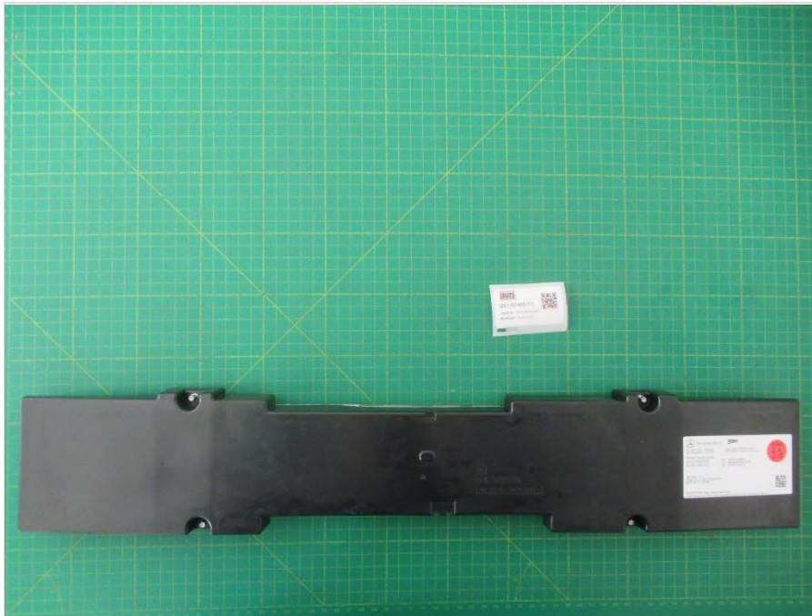
Photograph 1: EUT 1 / EUT 2 (identical looking samples)