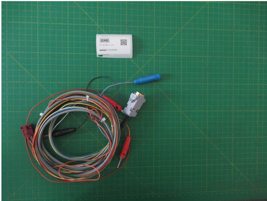
Photograph 9: CAB 2