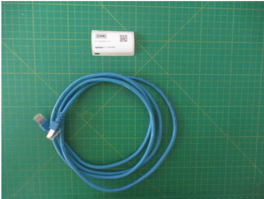
Photograph 11: CAB 4