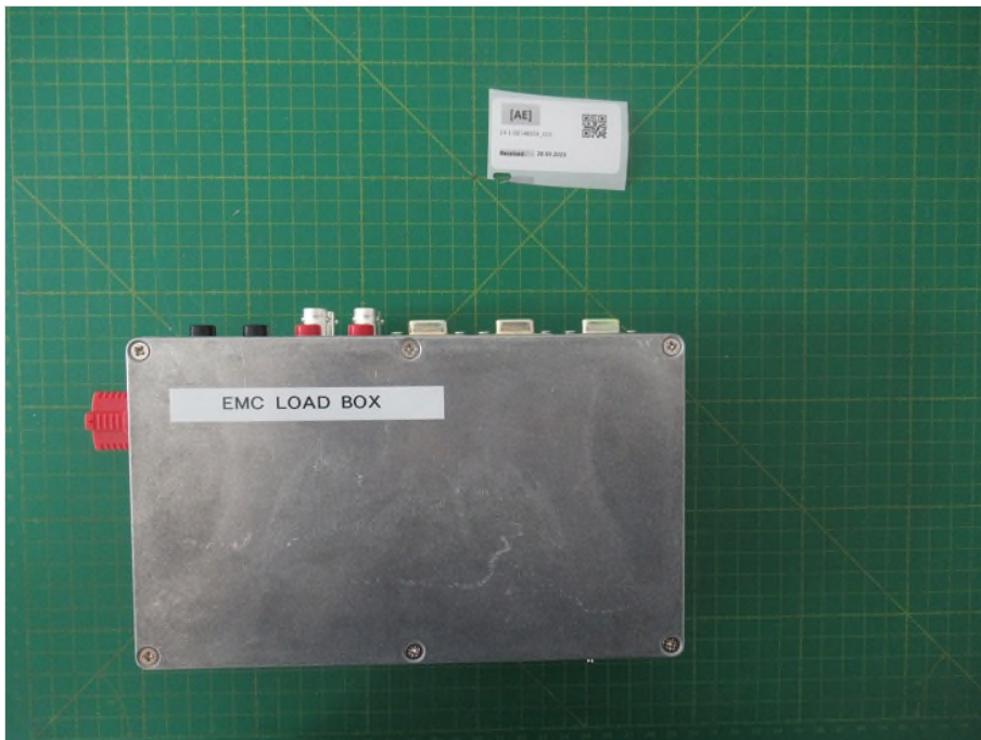
Photograph 6:AE 4