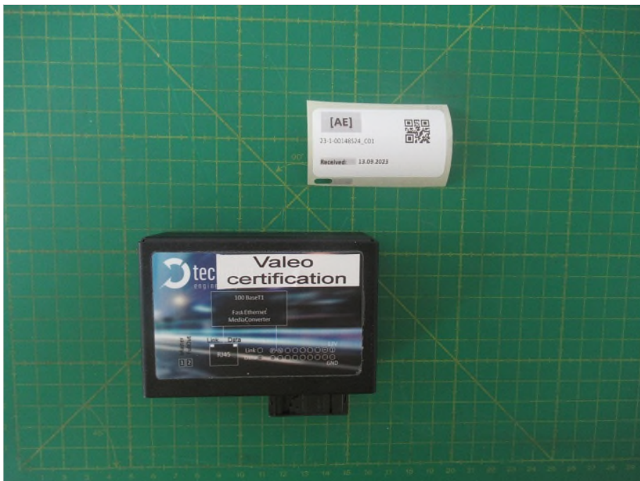
Photograph 4: AE 2