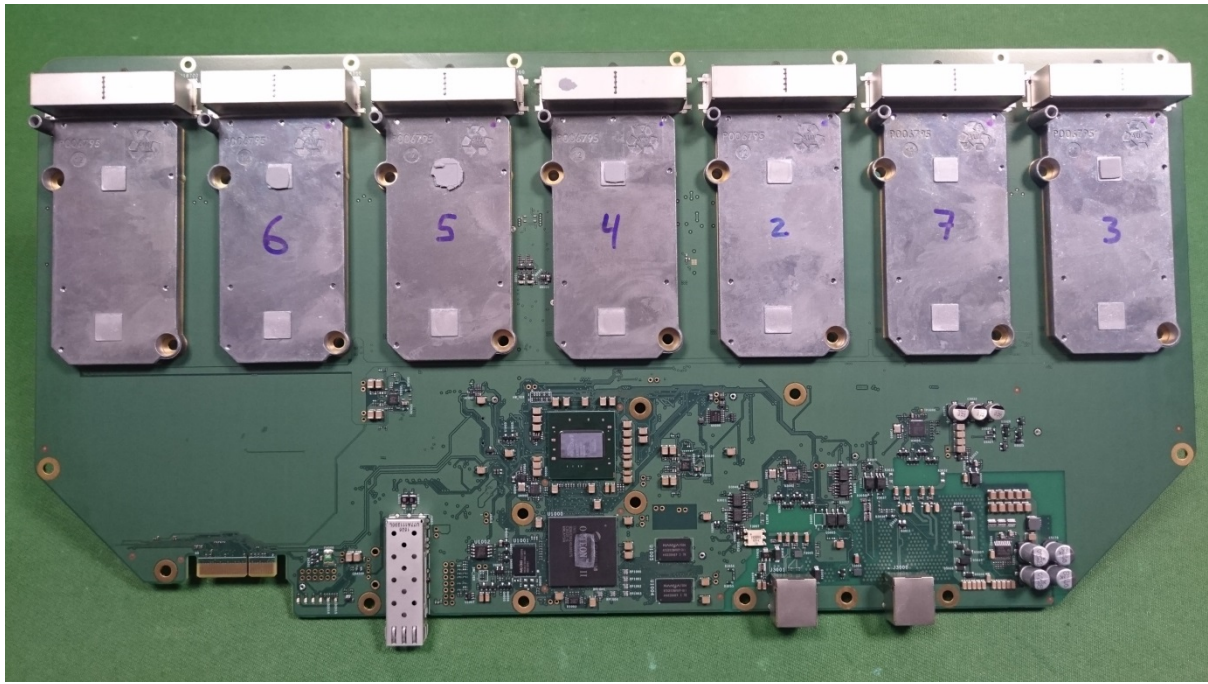
PMP 450m PCB A005138 Rear View (with RF Shields Fitted)