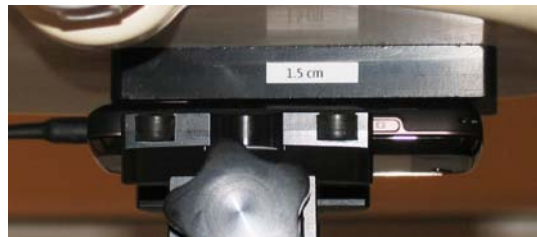
Photo of the device positioned for Body SAR measurement. The spacer was removed for the tests.

The device was placed in the SPEAG holder using the Nokia spacer and placed below the flat section of the phantom. The distance between the device and the phantom was kept at the separation distance indicated in the photo below using a separate flat spacer that was removed before the start of the measurements.