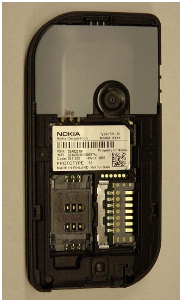
Photograph 1 – Label location