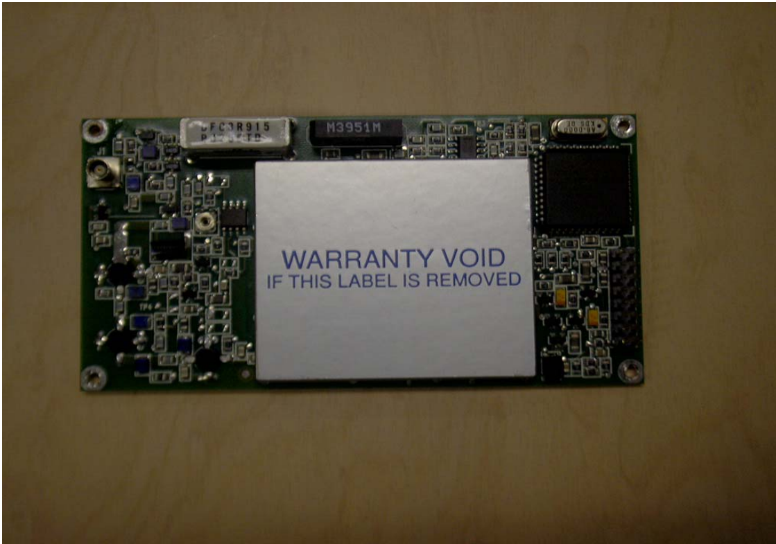
Photograph 5 - 4: Top Side of Radio Proxim.