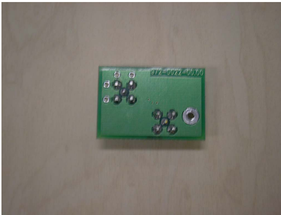
Photograph 5 - 9: Bottom Side of Filter.