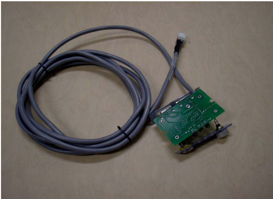
Photograph 5 - 13: Bottom Side of Junction Box.