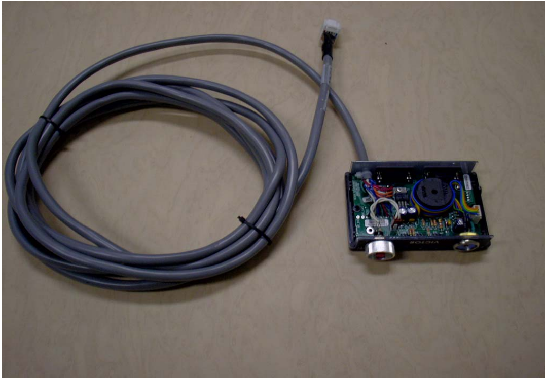
Photograph 5 - 12: Top Side of Junction Box.