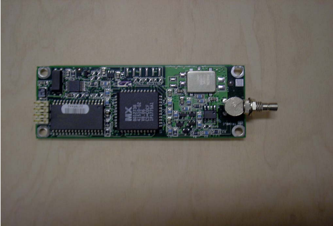
Photograph 5 - 6: Top Side of GPS receiver.