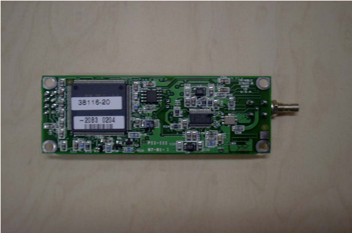
Photograph 5 - 7: Bottom Side of GPS receiver.