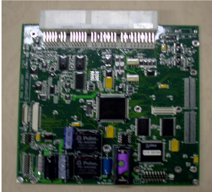
Photograph 5 - 2: Top Side of Main board.