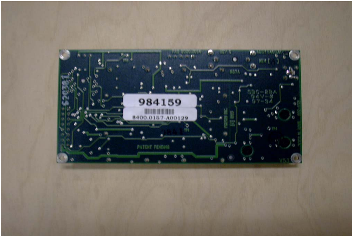
Photograph 5 - 5: Bottom Side of Radio Proxim.