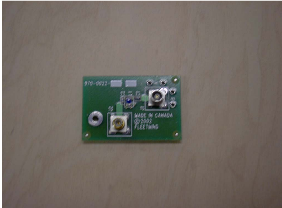
Photograph 5 - 8: Top Side of Filter.