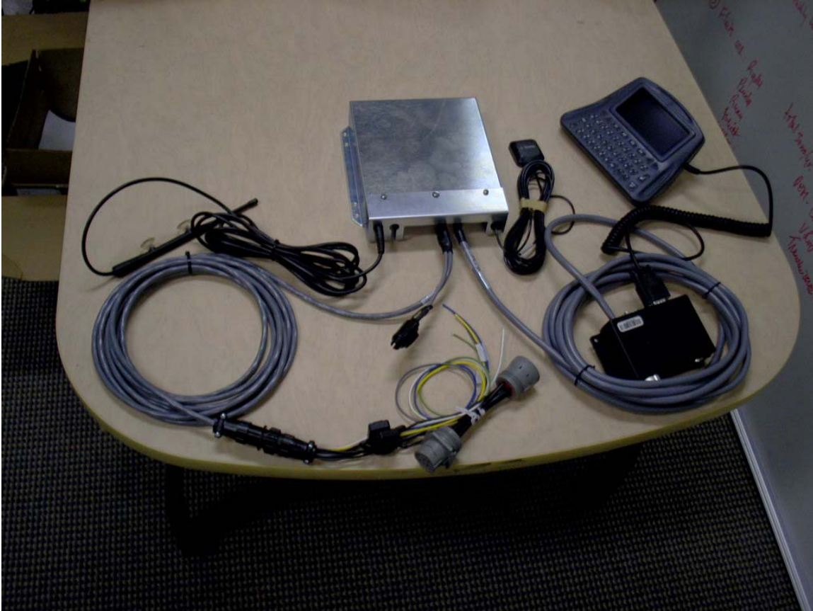
Photograph 5 - 1: Complet system.