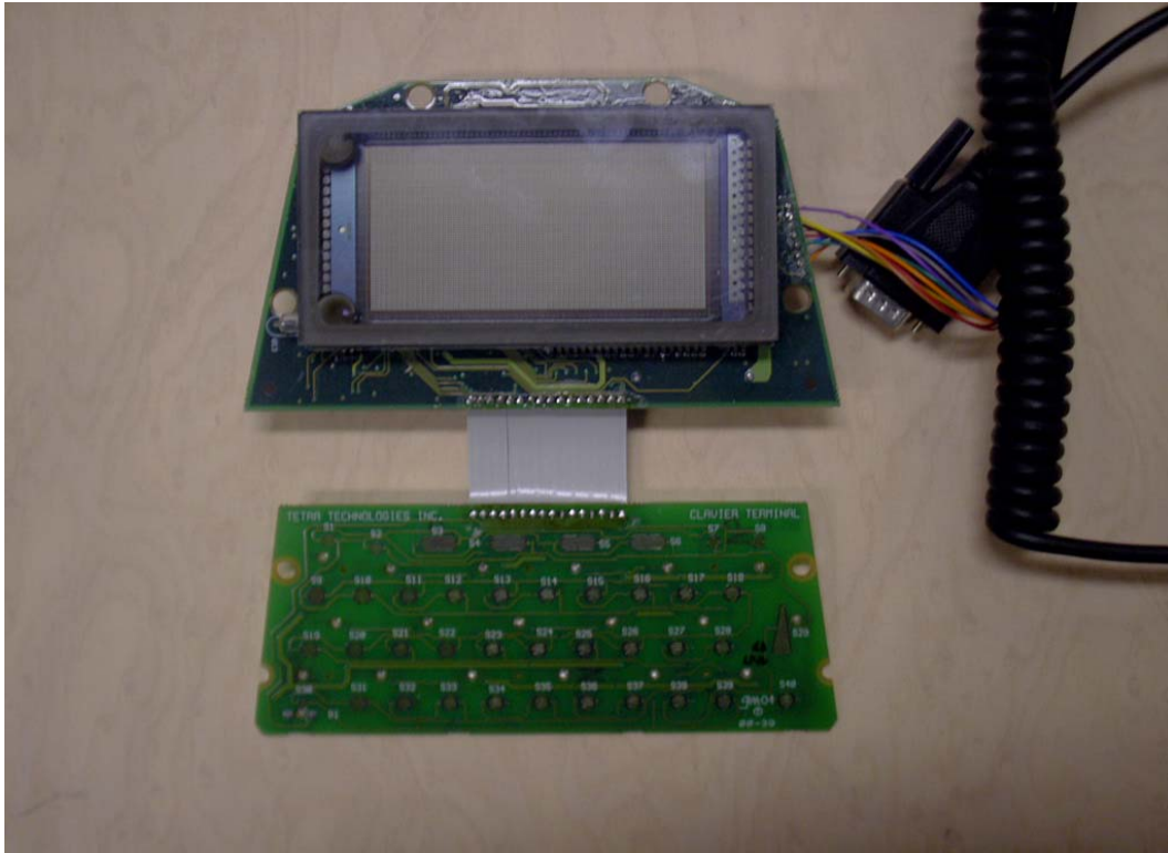
Photograph 5 - 10: Top Side of Terminal.