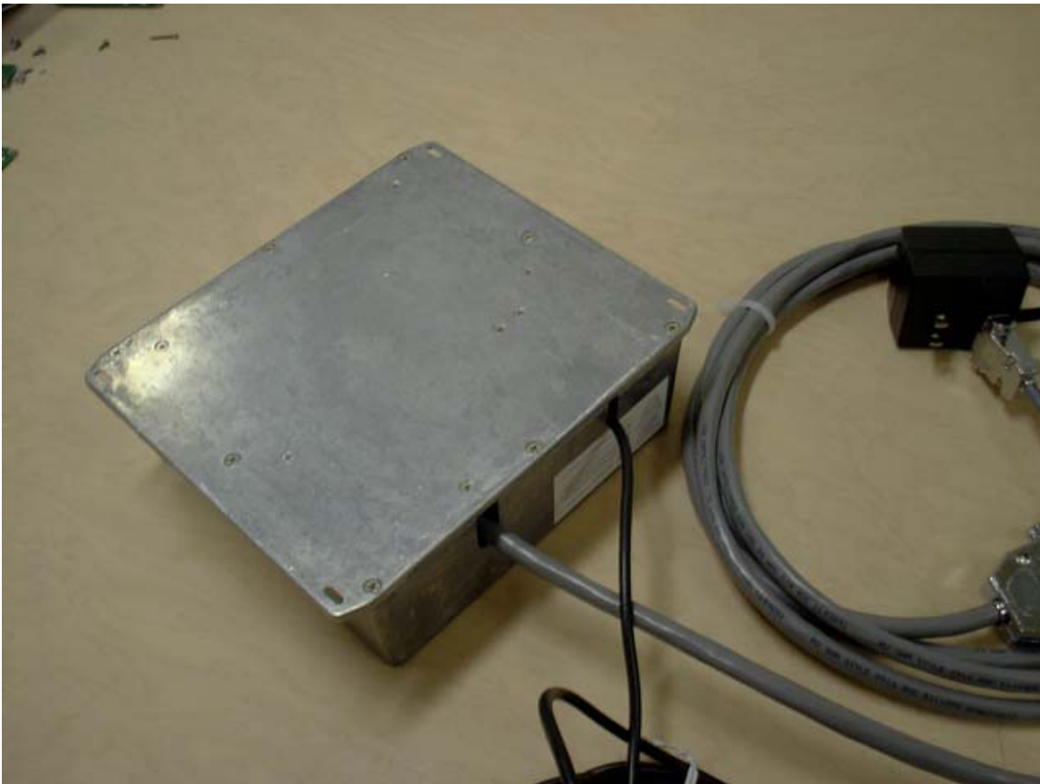
Photograph 4 - 4: Bottom view of the Access Point 300.