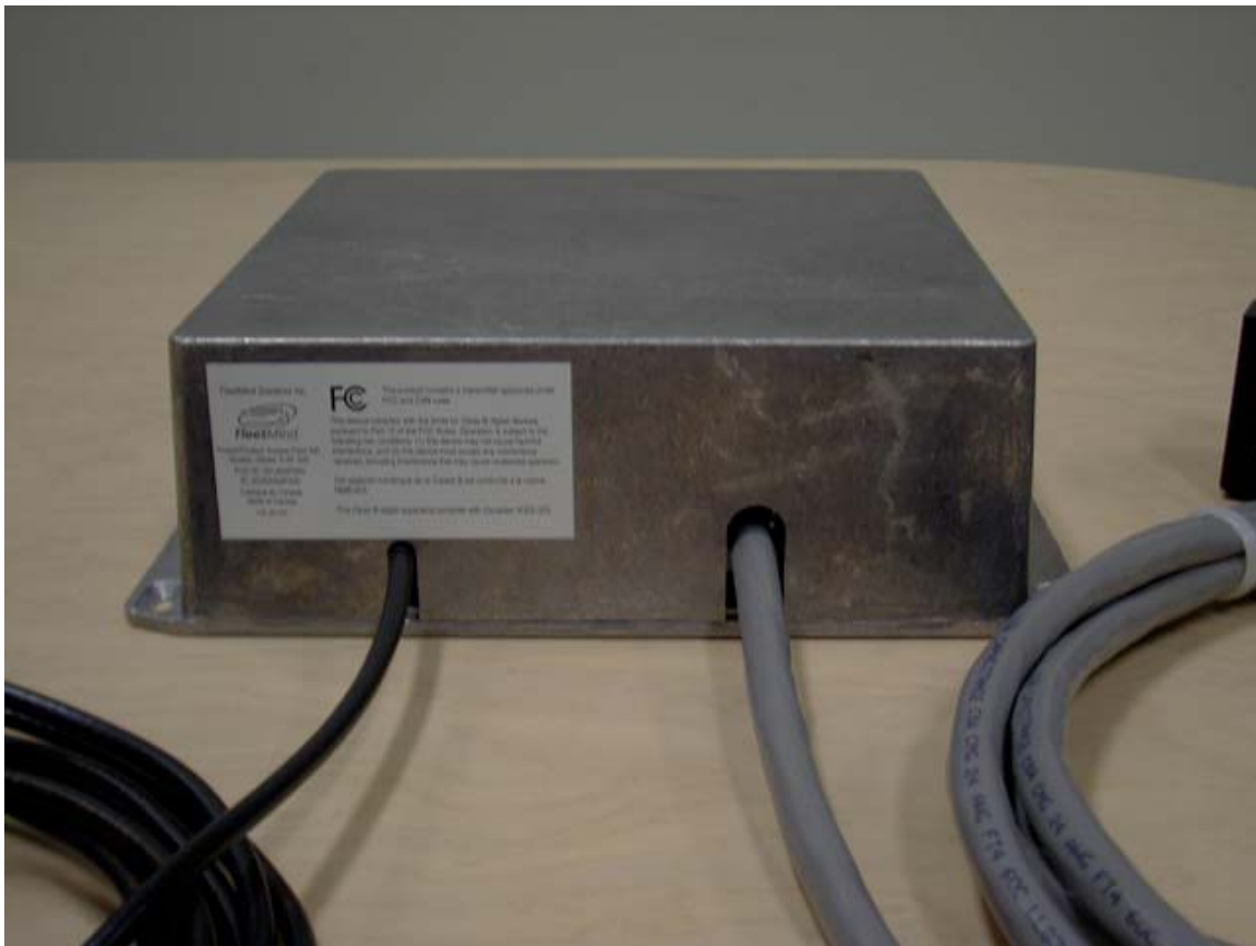
Photograph 4 - 2: Front view of the Access Point 300.