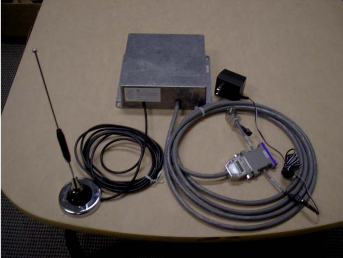
Photograph 4 - 1: Complete system.