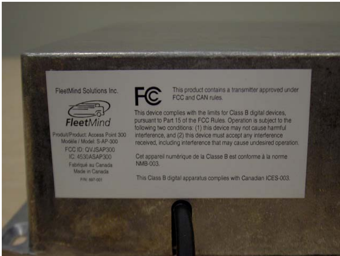
Photograph 4 - 3: Close-up front view of the Access Point 300.