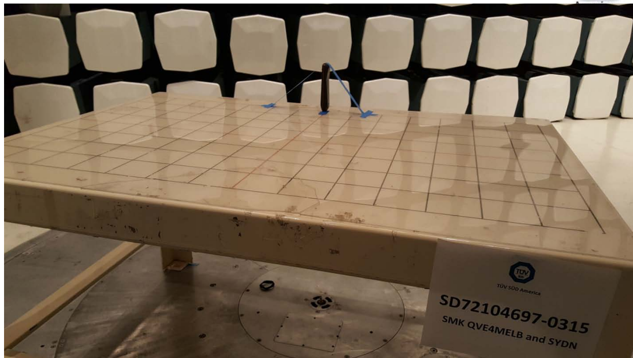
Figure 3 (Front Picture)