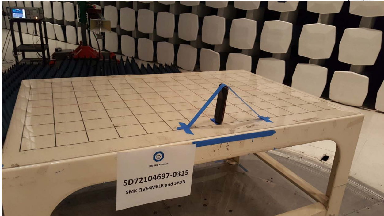
Figure 2 (1GHz-18GHz Rear Picture)