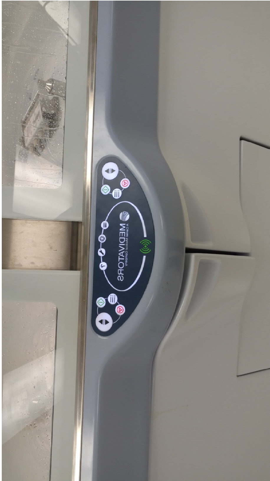
Figure 6 Dirty side membrane panel where dirty side RFID antenna is mounted (Note picture is sideways, top of the Advantage Plus Pass-Thru is on the left)