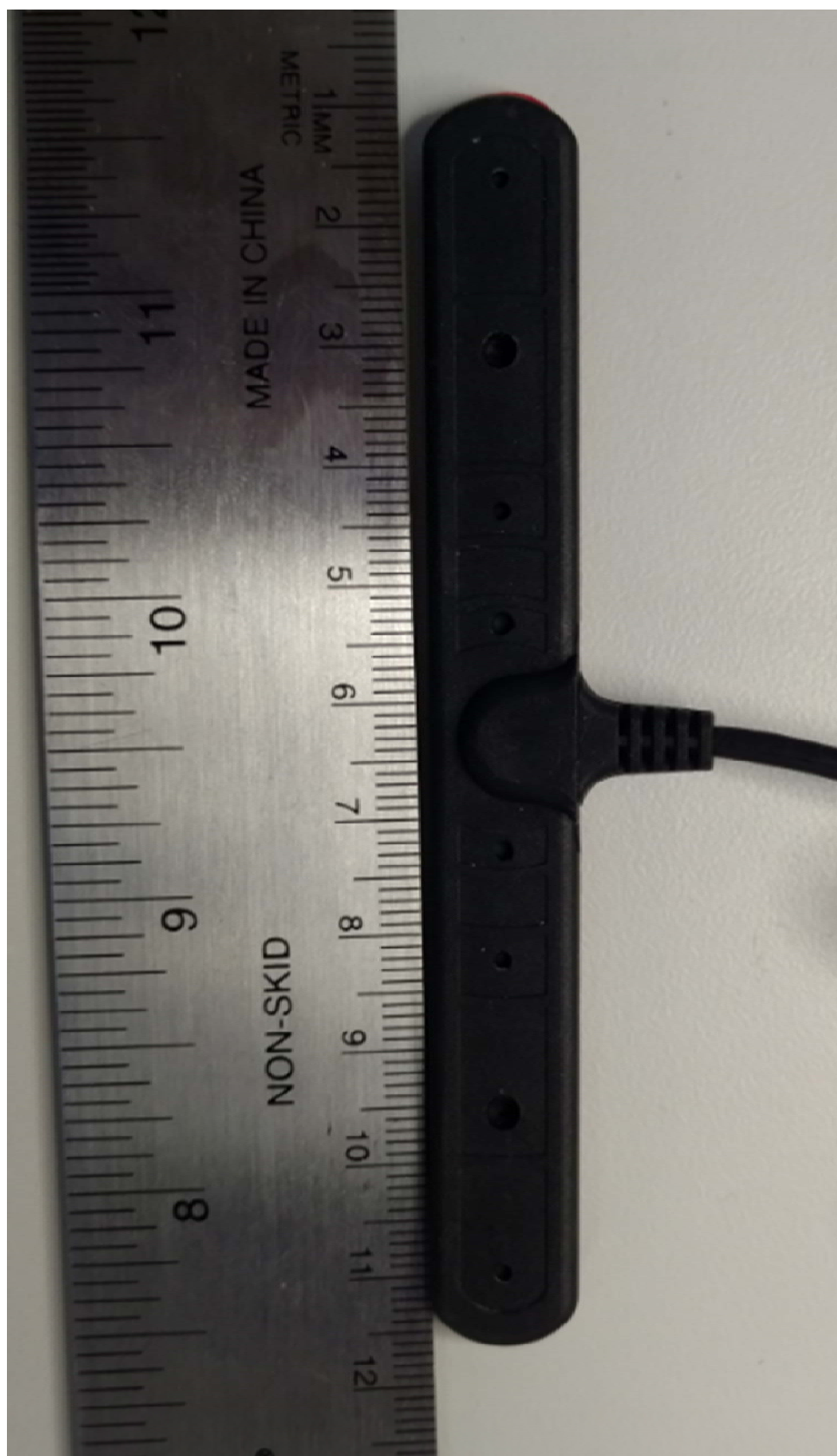
Figure 7 RFID antenna