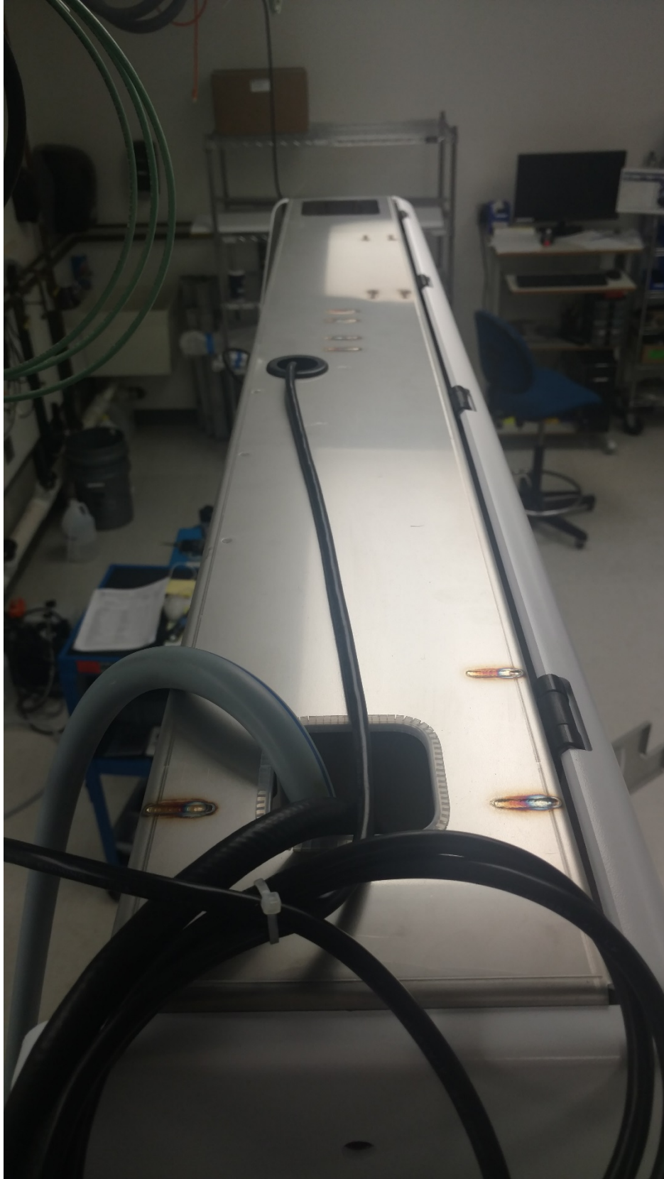
Figure 12 Top of Advantage Plus Pass-Thru