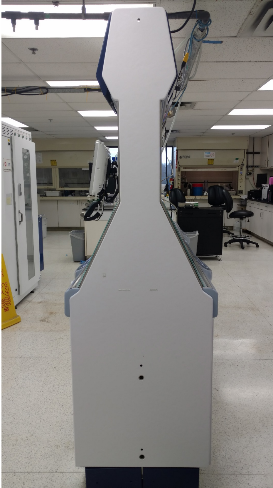
Figure 10 Advantage Plus Pass-Thru side one