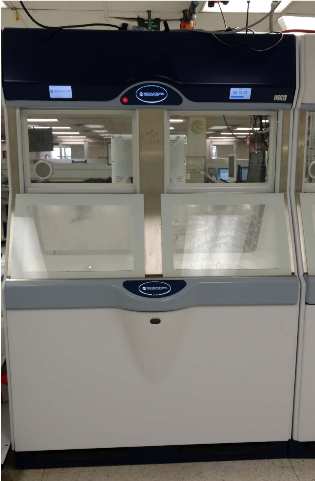
Figure 9 Clean Side Advantage Plus Pass-Thru