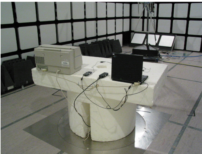
Picture 2 Radiated emission 15B