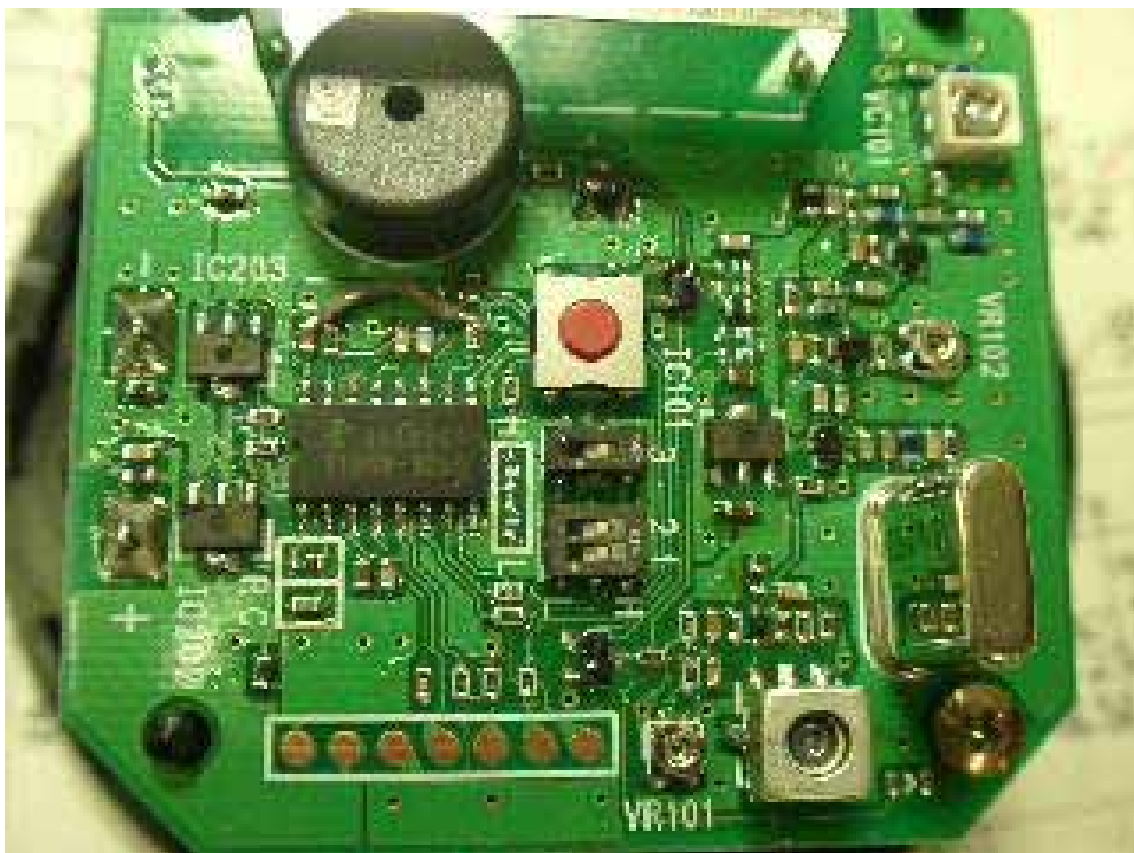
Internal Photo 2: Circuit Board Top Side Expanded