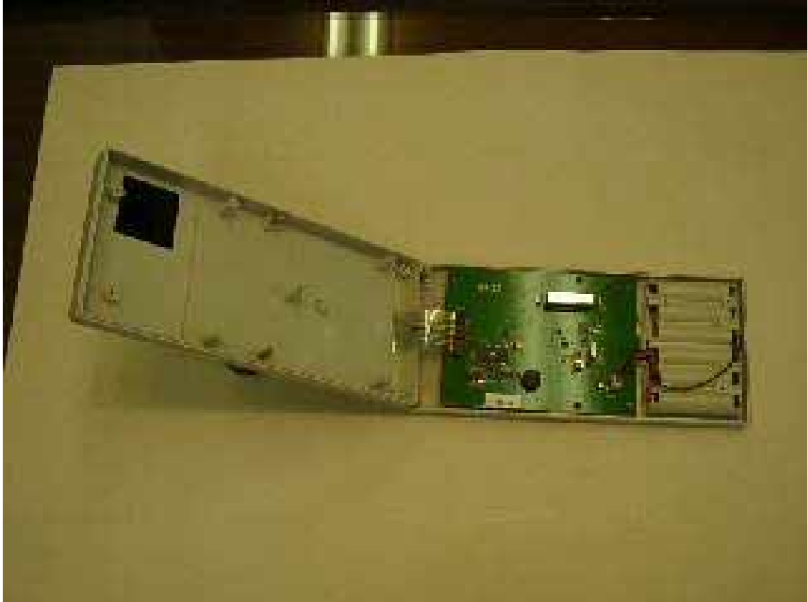
Internal Photo 2: Circuit Board Bottom Side