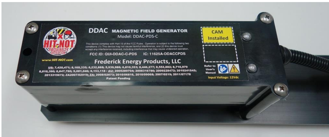
MFG with CAM Label (Label 1)

If equipped with a CAM, the white dotted box in the upper right corner will contain a label stating "CAM Installed". Model number for generator with CAM is DDAC-PDS-C. Model number for generator without CAM is DDAC-PDS