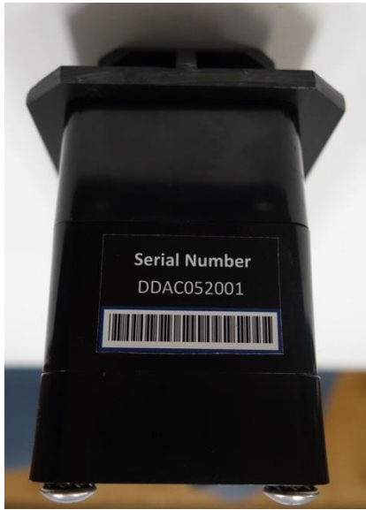
Serial No. Label for Standard MFG (Label 2)