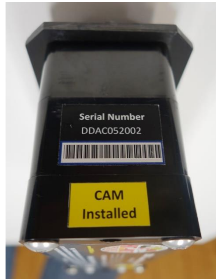
Serial No. Label for MFG with CAM (Label 2)