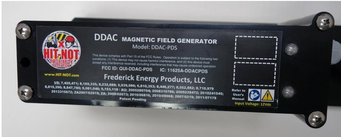
Standard MFG Label (Label 1)