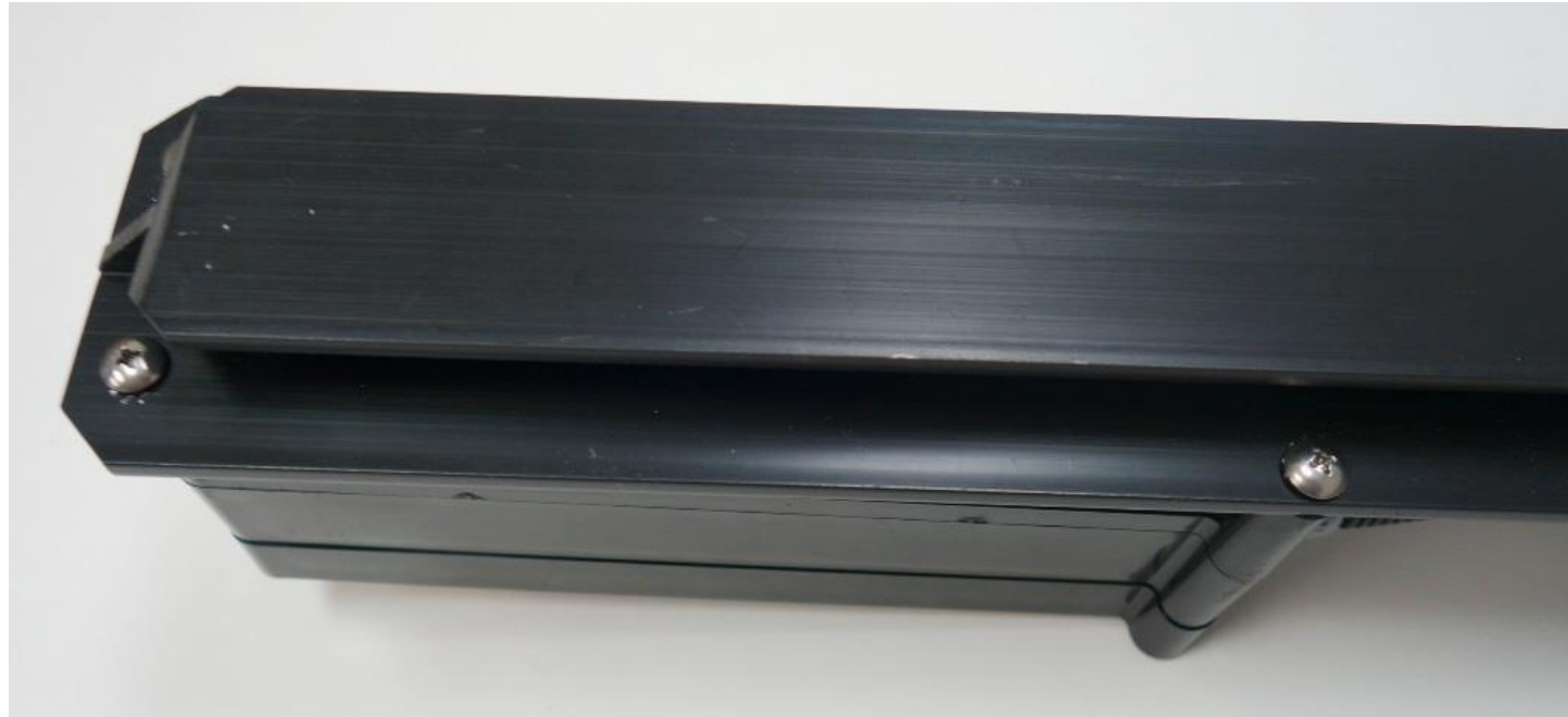
Magnetic Field Generator w/ CAM -External Photo Ferrite Side with Mounting Arm