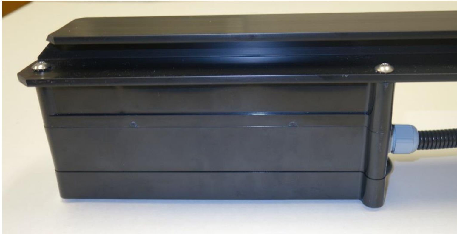
Magnetic Field Generator w/ CAM -External Photo Side View with Mounting Arm