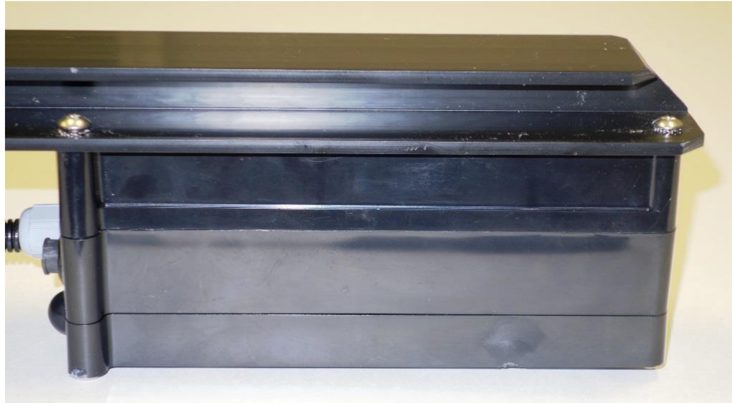
Magnetic Field Generator w/ CAM -External Photo Side View with Mounting Arm