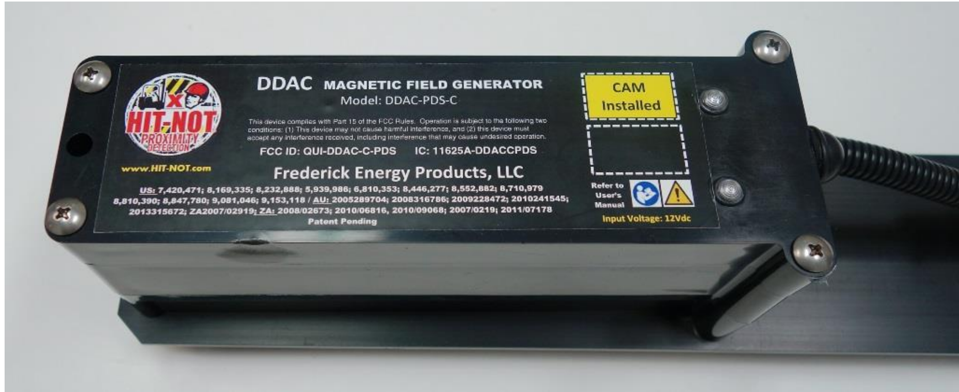
Magnetic Field Generator w/ CAM -External Photo Label Side with Mounting Arm