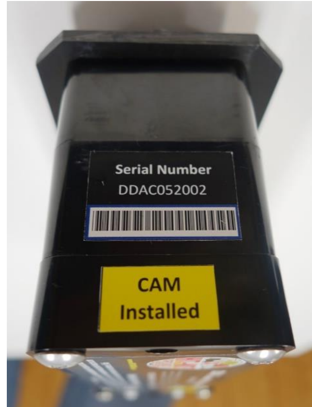
Magnetic Field Generator w/ CAM -External Photo End View with Mounting Arm