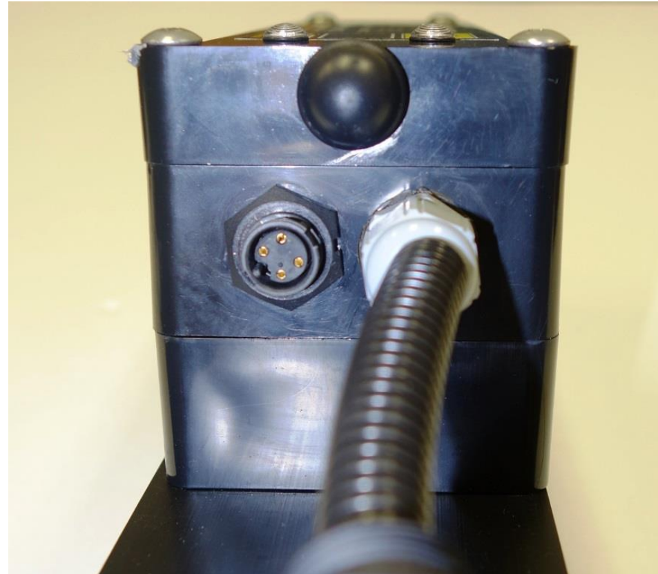
Magnetic Field Generator w/ CAM -External Photo Interface End View with Antenna