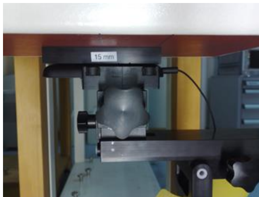
Photo of the device positioned for Body SAR measurement. The spacer was removed for the tests.

The device was placed in the SPEAG holder using the Nokia spacer and placed below the flat phantom. The distance between the device and the phantom was kept at the separation distance indicated in the photo below using a separate flat spacer that was removed before the start of the measurements. The device was oriented with both sides facing the phantom to find the highest results.