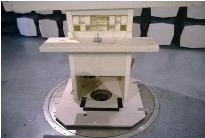
Picture 2. FCC Part 15B Radiated emissions