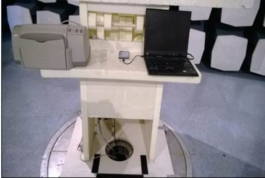
Picture 3. FCC Part 15B Radiated emissions, computer peripherals