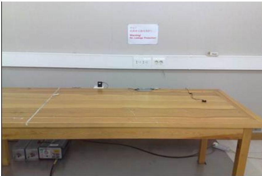
Picture 4. FCC Part 15C AC powerline conducted emissions