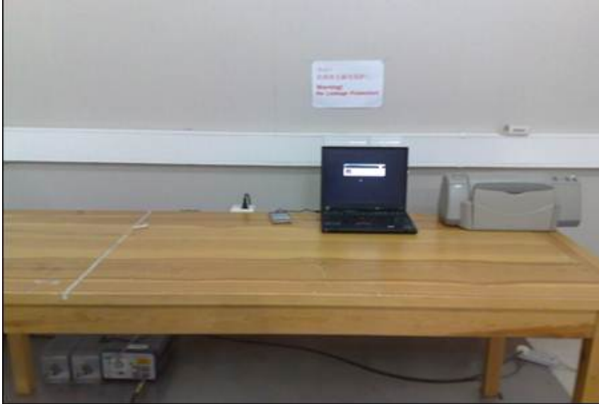
Picture 5. FCC Part 15B AC powerline conducted emissions, computer peripherals, measure from PC charger