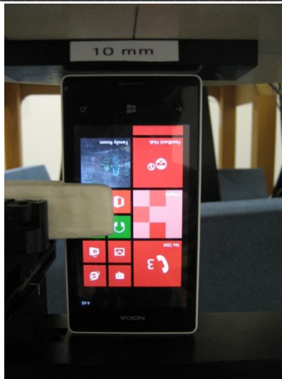
Photo of the device positioned for WR mode measurement – bottom edge facing phantom. The spacer was removed before the start of the measurements.