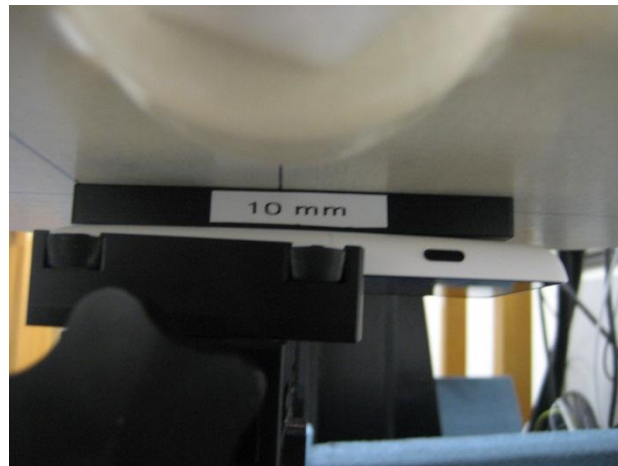
Photo of the device positioned for WR mode measurement – back facing phantom. The spacer was removed before the start of the measurements.

The device was placed in the SPEAG holder using the Nokia spacer and positioned 10.0mm away from the flat phantom. The spacer was removed before the start of the measurements.