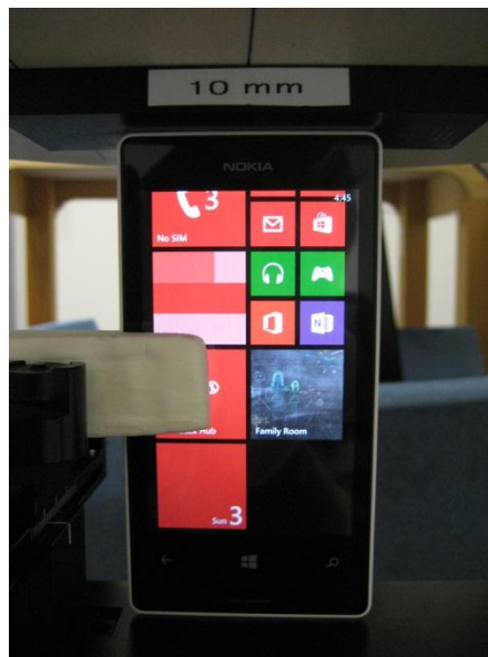
Photo of the device positioned for WR mode measurement – top edge facing phantom. The spacer was removed before the start of the measurements.