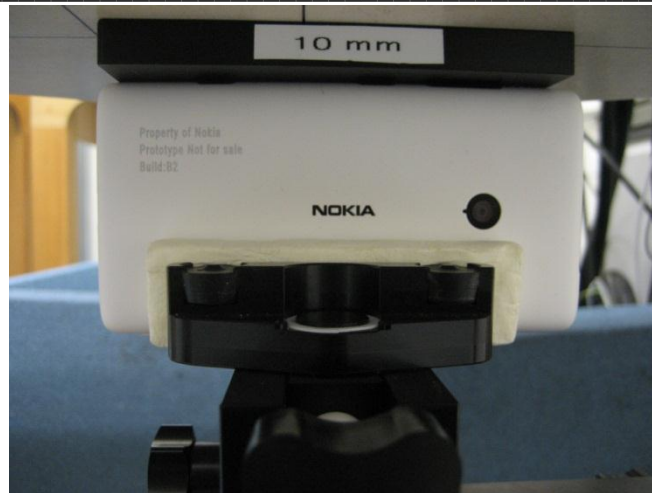
Photo of the device positioned for WR mode measurement – right edge facing phantom. The spacer was removed before the start of the measurements.