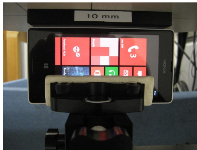
Photo of the device positioned for WR mode measurement – left edge facing phantom. The spacer was removed before the start of the measurements.