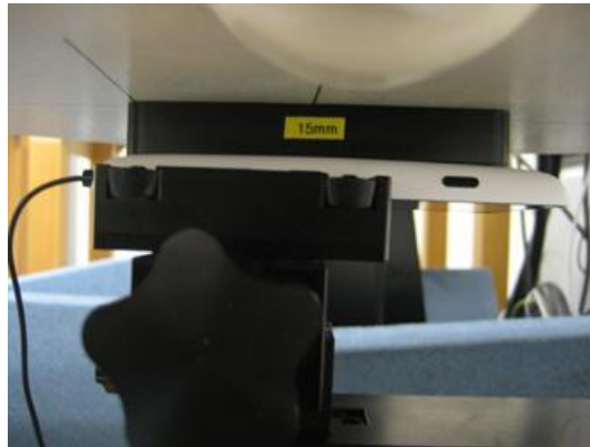
Photo of the device positioned for Body SAR measurement. The spacer was removed for the tests.

Nokia body-worn accessories are commonly available for the separation distance used in this testing.