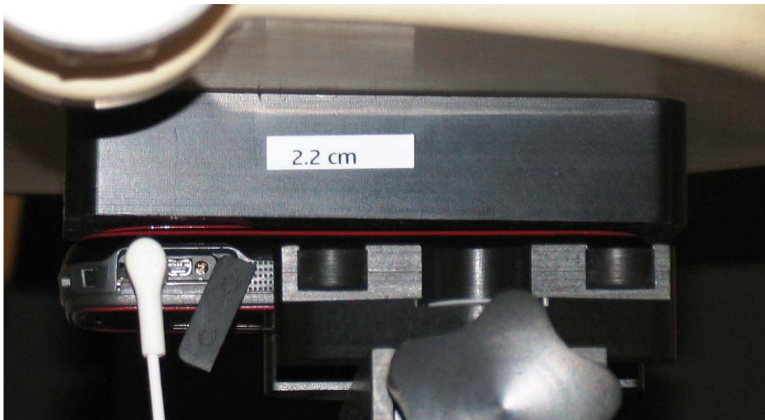
Photo of the device positioned for Body SAR measurement. The spacer was removed for the tests.

The device was placed in the SPEAG holder using the Nokia spacer and placed below the flat section of the phantom. The distance between the device and the phantom was kept at the separation distance indicated in Section 1.2.2 using a separate flat spacer that was removed before the start of the measurements. The device was oriented with both sides facing the phantom to find the highest results.