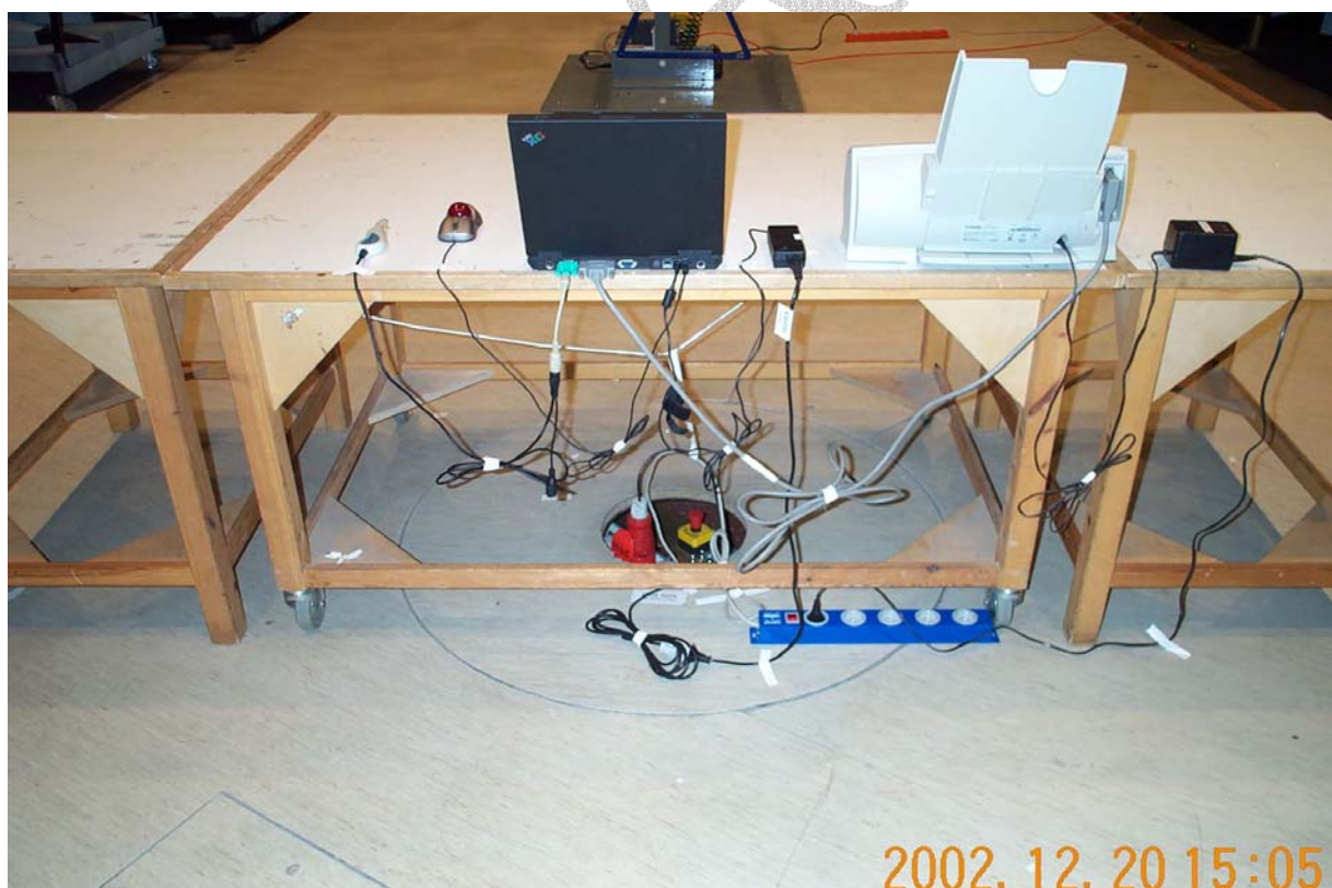
Photo A3.3 Radiated electromagnetic field measurement.