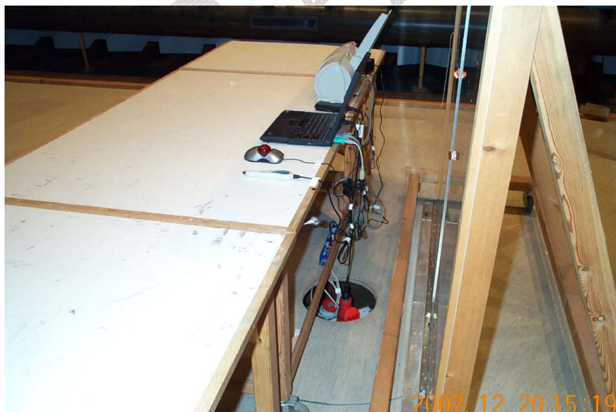
Photo A2.2 AC mains conducted emission measurement