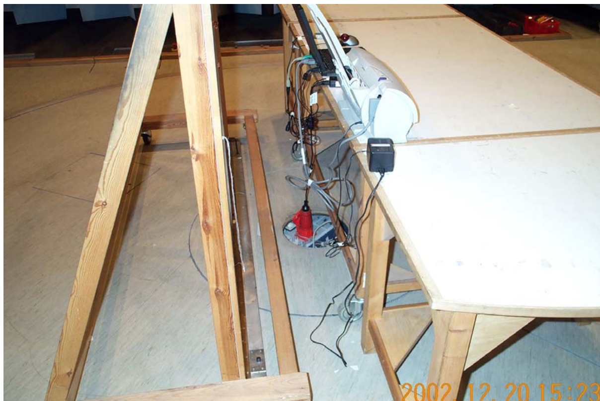
Photo A2.3 AC mains conducted emission measurement