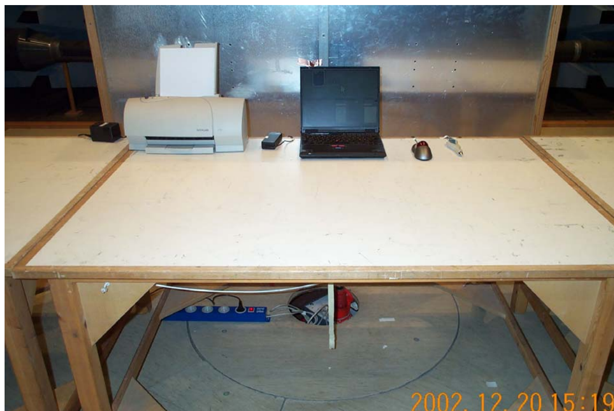
Photo A2.1 AC mains conducted emission measurement