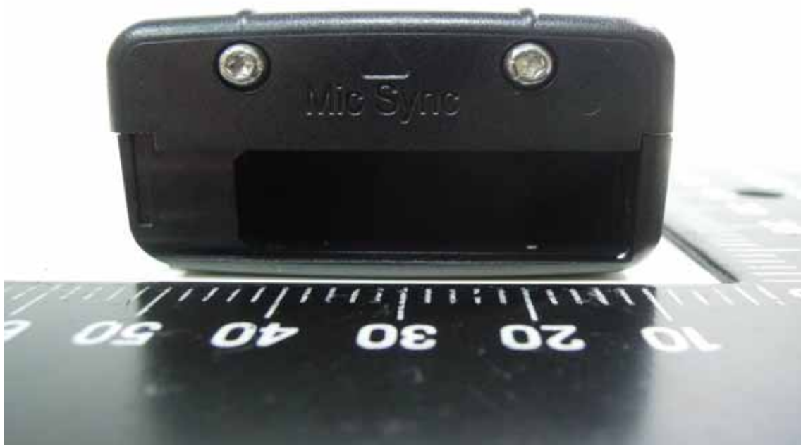
Front View of EUT (GWD910T)