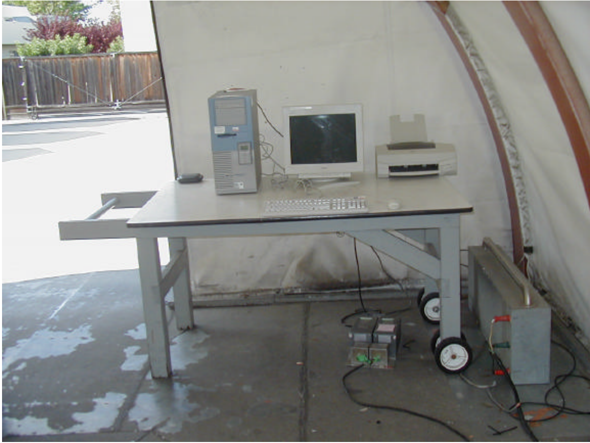
AC Conducted Emission Photo 1 of 2