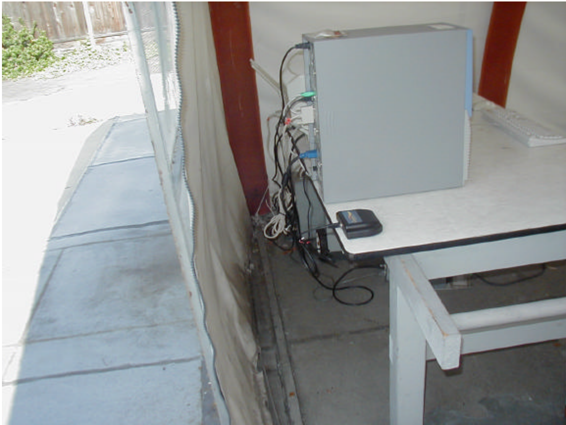
AC Conducted Emission Photo 2 of 2