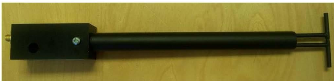
Figure 1 – MVG COMOSAR Validation Dipole

MVG's COMOSAR Validation Dipoles are built in accordance to the IEC/IEEE 62209-1528 and FCC KDB865664 D01 standards. The product is designed for use with the COMOSAR test bench only.