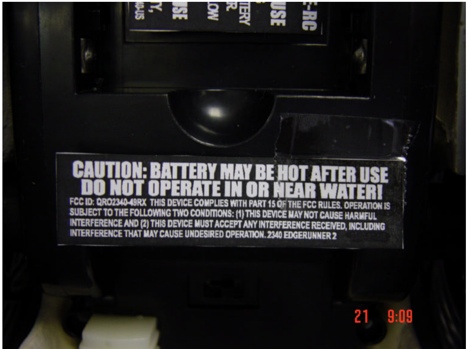
Label Size : 67 mm x 17 mm