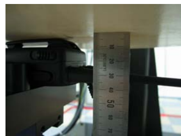
Figure 12. Body SAR Test Setup