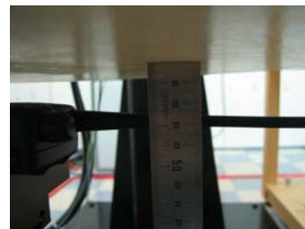
Figure 11. Mouth Face SAR Test Setup