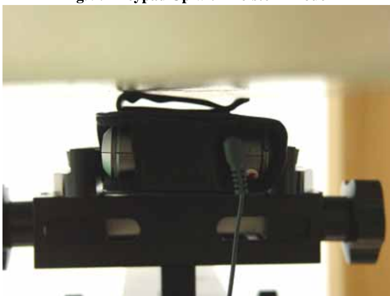
Fig. 9.2 Keypad Down with Holster 1 Touch