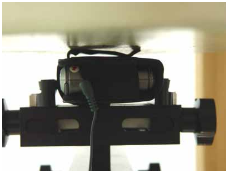
Fig. 9.7 Keypad Up with Holster 1 Touch