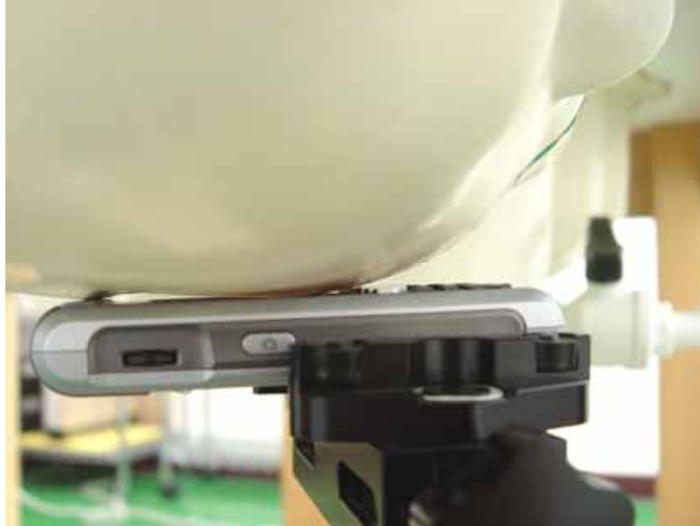
Fig. 9.3 Right Cheek