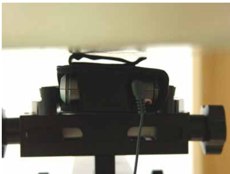
Fig. 9.8 Keypad Down with Holster 1 Touch