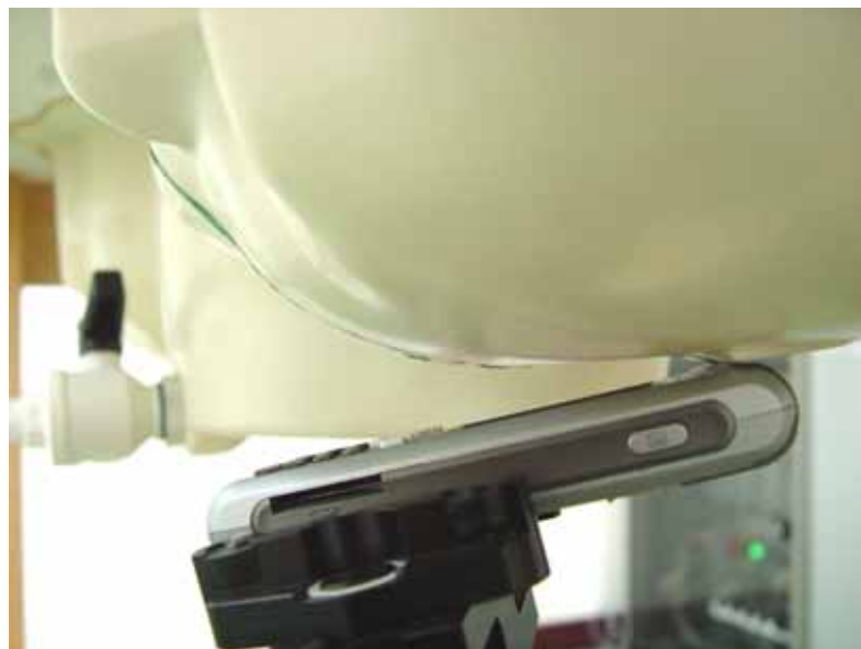
Fig. 9.6 Left Tilted