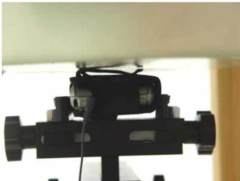
Fig. 9.9 Keypad Up with Holster 2 Touch