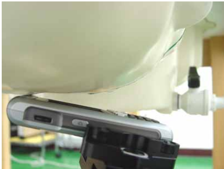
Fig. 9.4 Right Tilted