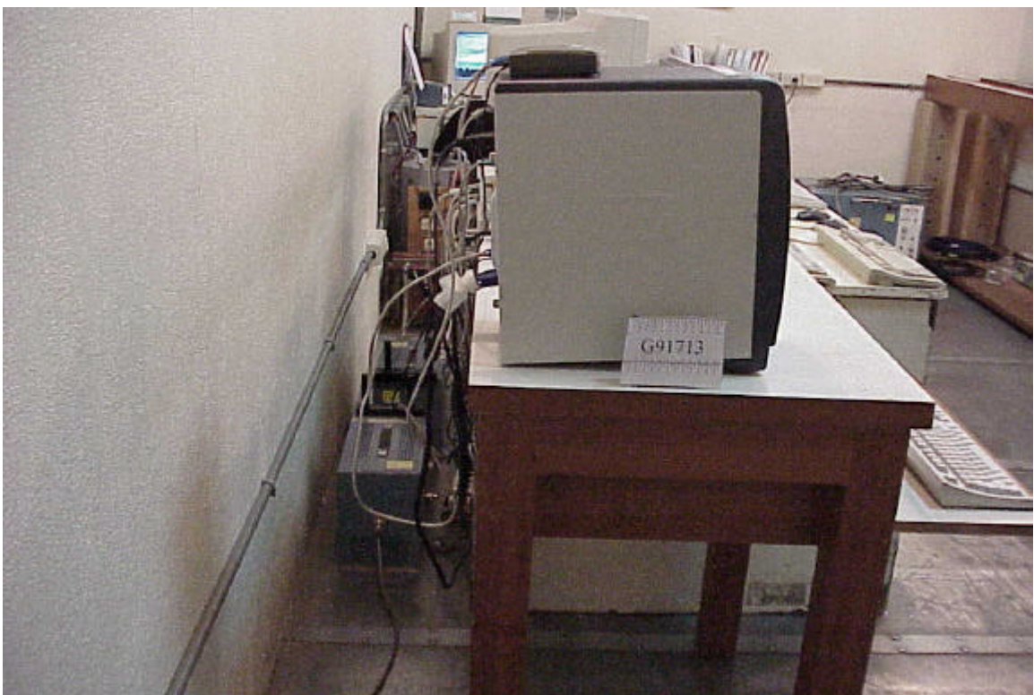
BACK VIEW OF CONDUCTED TEST