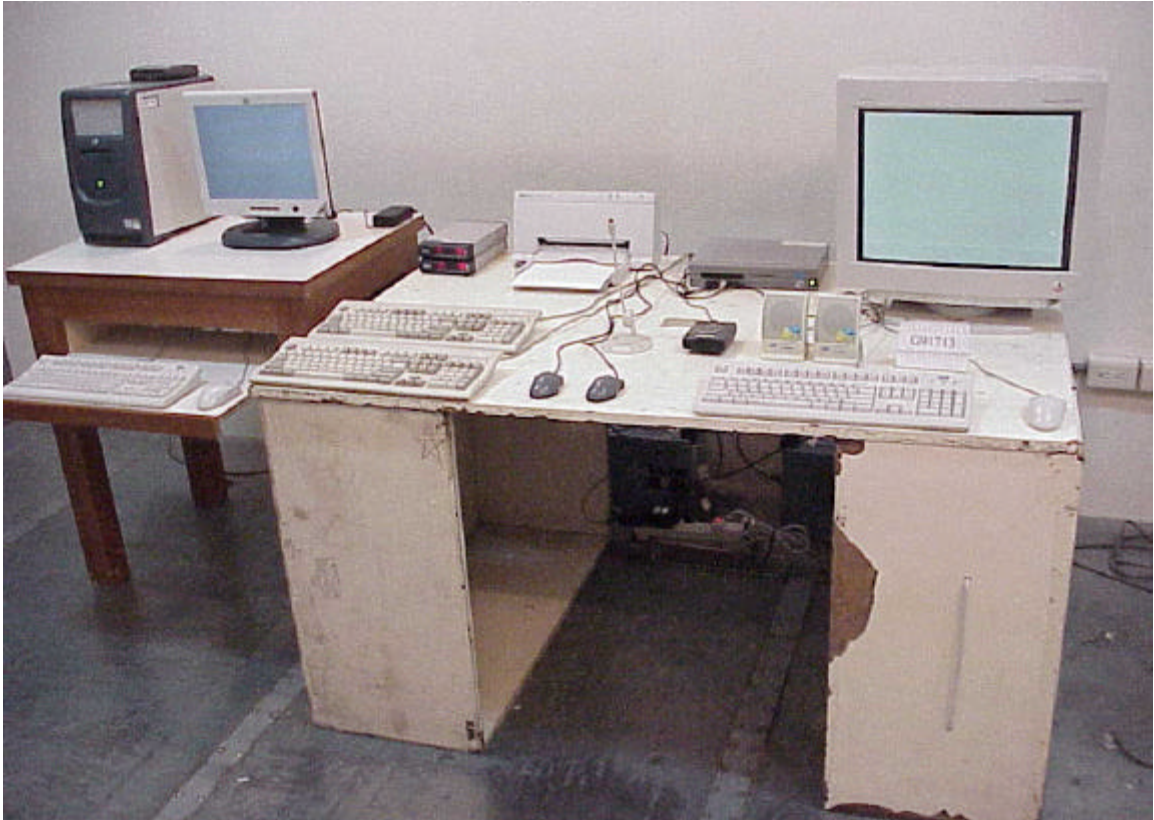
FRONT VIEW OF CONDUCTED TEST