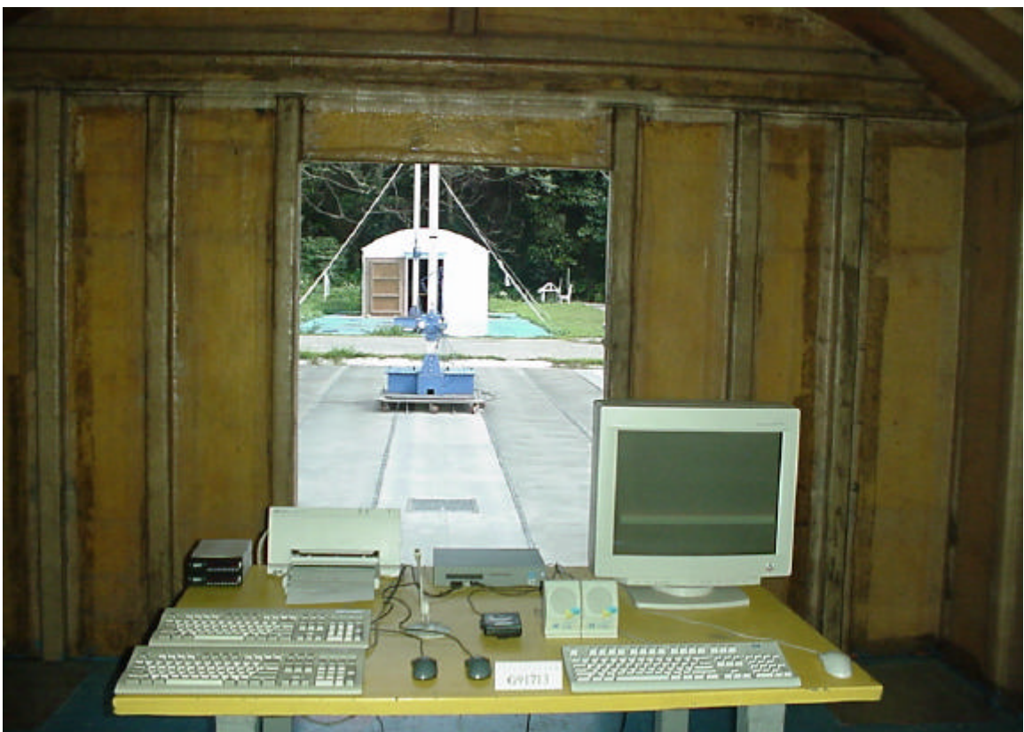
SETUP WITH MAXIMUM DETECTED EMISSION AT VERTICAL POLARIZATION