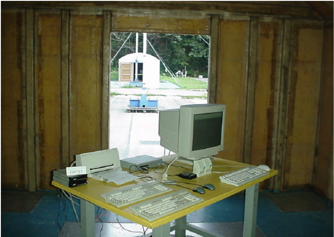
SETUP WITH MAXIMUM DETECTED EMISSION AT HORIZONTAL POLARIZATION