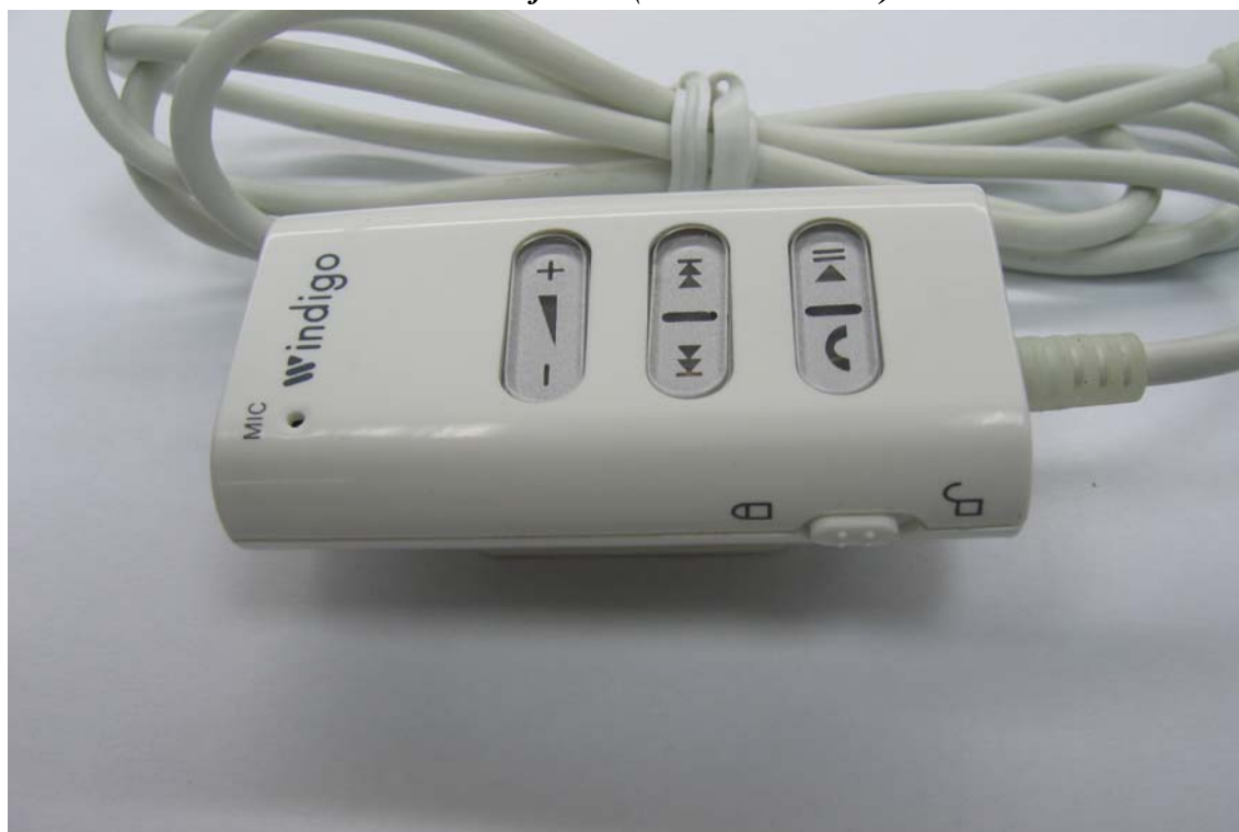
Side View of EUT (PBTMAF2C2-X)

The results shown in this test report refer only to the sample(s) tested unless otherwise stated. This test report cannot be reproduced, except in full, without prior written permission of the Company.