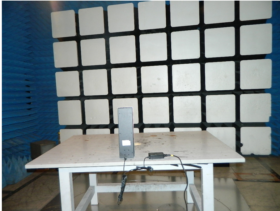
Conducted Measurement Photo