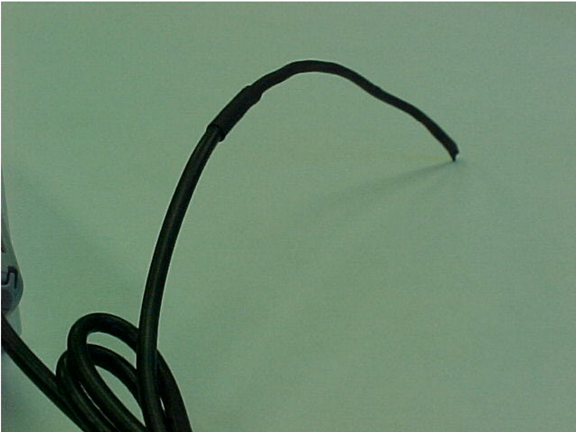
Photo Four - 900 MHz Antenna Antenna lead from Boomerang -Tracking Beacon