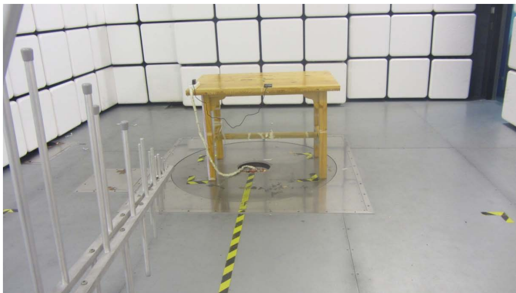
a: Below 1GHz