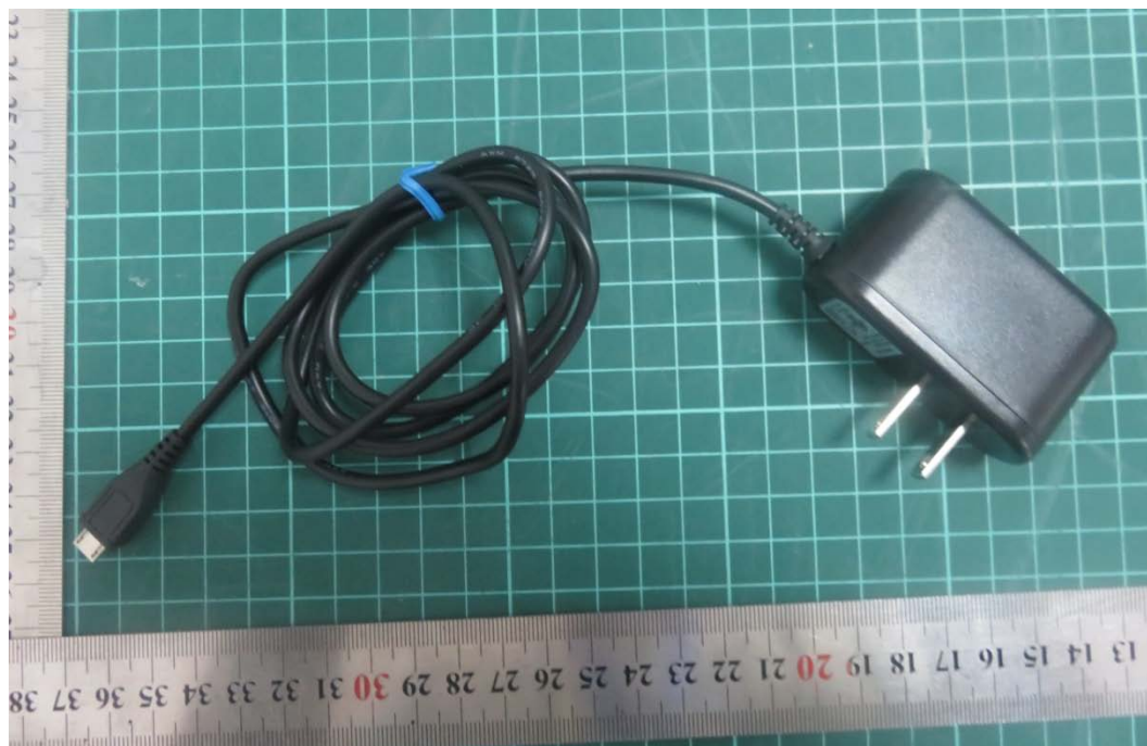
b: Adapter Picture 1 EUT