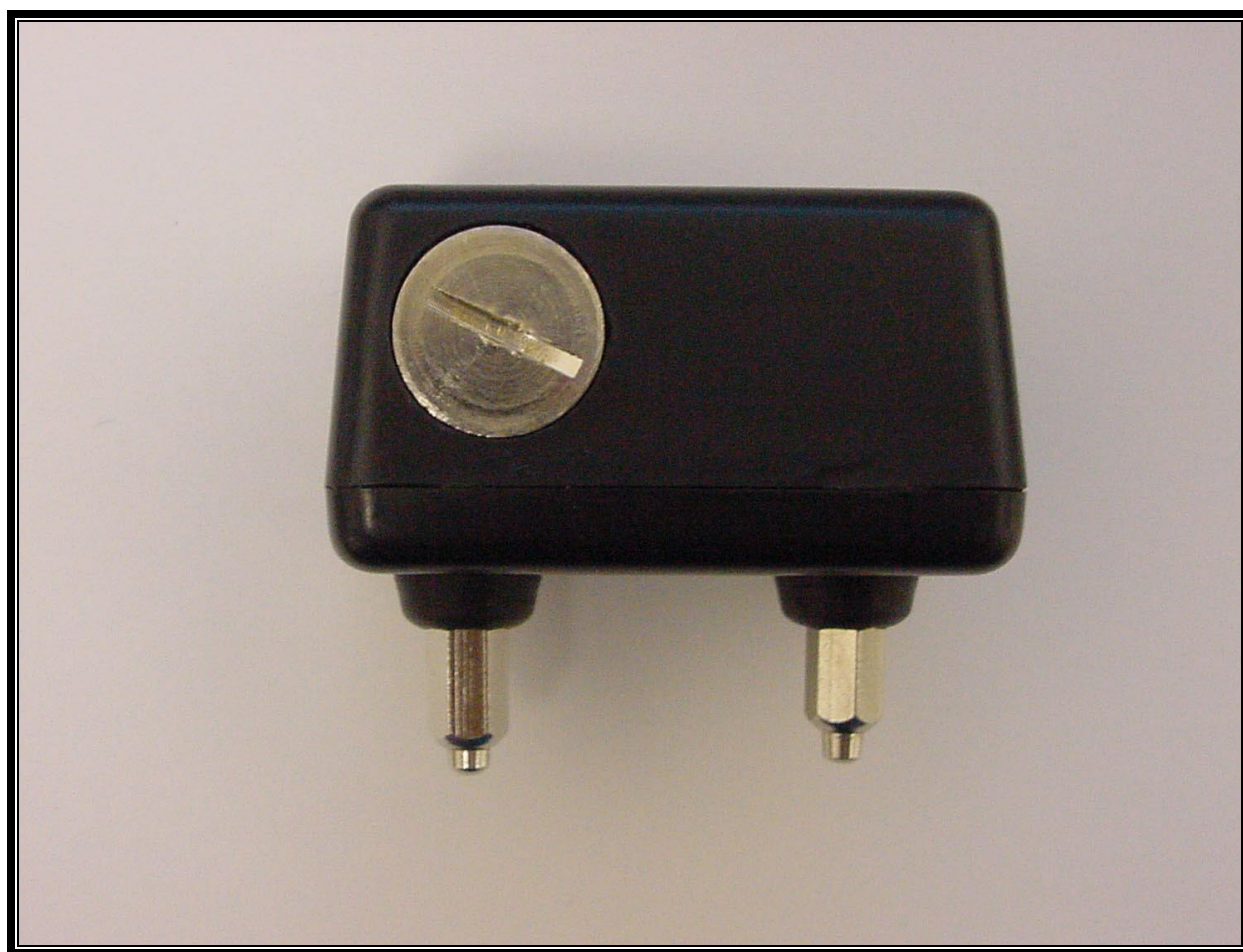
PHOTOGRAPH 15: RECEIVER – SIDE VIEW

Client: High Tech Pet Products, Inc. Report Number: 2002206 FCC: Part 15 FCC ID: QP4HC-5000 M/N: HC-5000