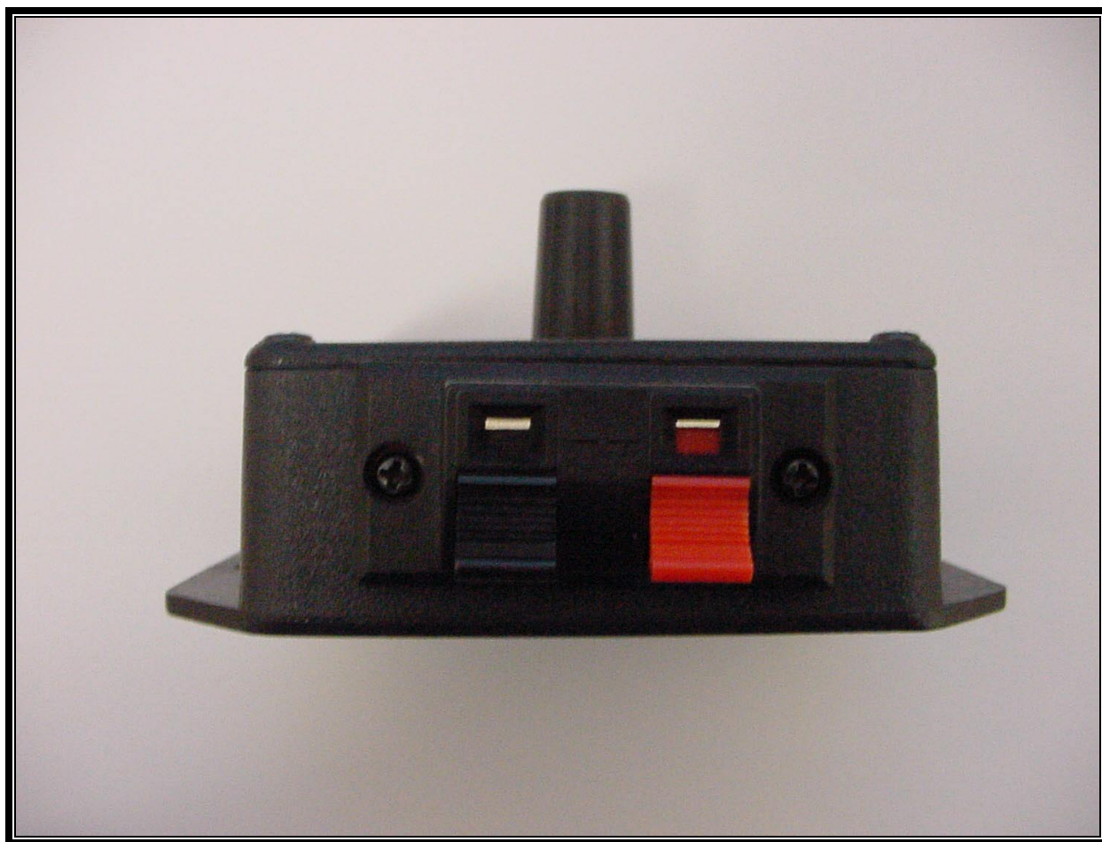
PHOTOGRAPH 18: TRANSMITTER – SIDE VIEW

Client: High Tech Pet Products, Inc. Report Number: 2002206 FCC: Part 15 FCC ID: QP4HC-5000 M/N: HC-5000