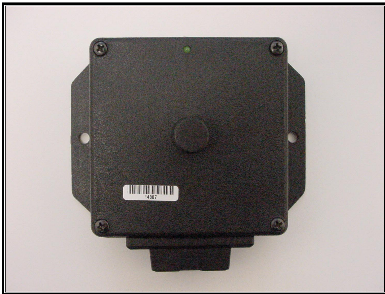
PHOTOGRAPH 20: TRANSMITTER – TOP VIEW

Client: High Tech Pet Products, Inc. Report Number: 2002206 FCC: Part 15 FCC ID: QP4HC-5000 M/N: HC-5000