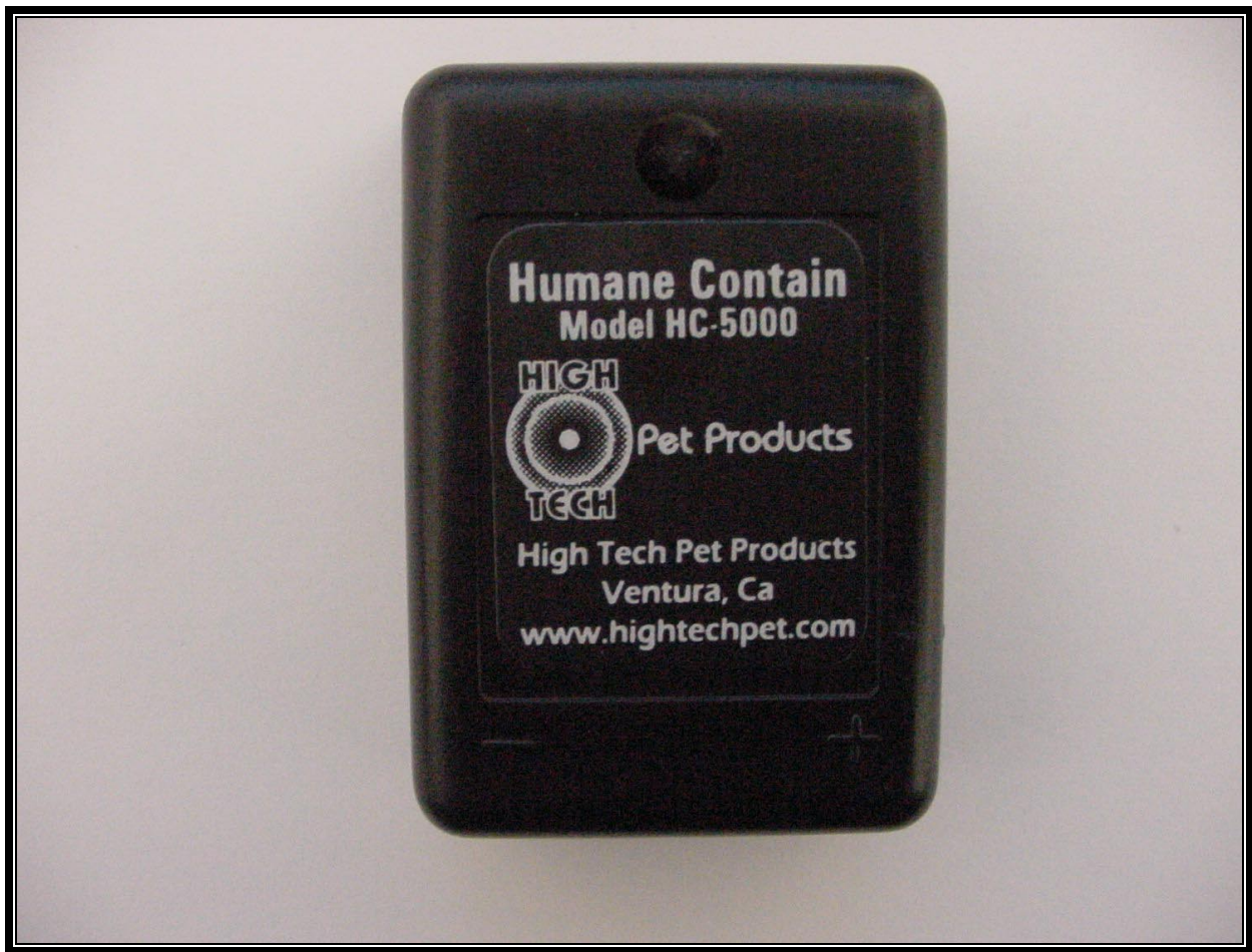
PHOTOGRAPH 17: RECEIVER – TOP VIEW

Client: High Tech Pet Products, Inc. Report Number: 2002206 FCC: Part 15 FCC ID: QP4HC-5000 M/N: HC-5000