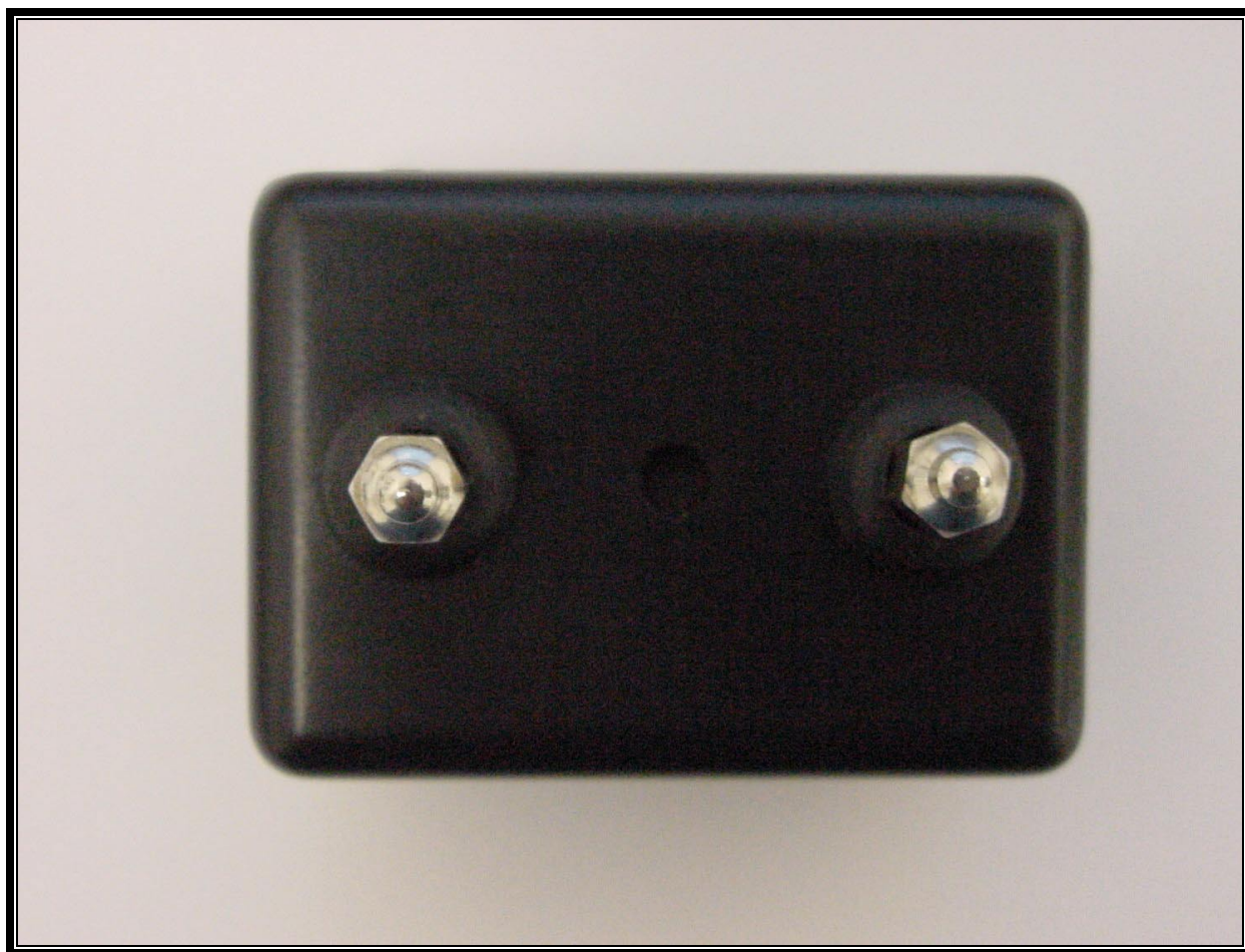
PHOTOGRAPH 16: RECEIVER - BOTTOM VIEW

Client: High Tech Pet Products, Inc. Report Number: 2002206 FCC: Part 15 FCC ID: QP4HC-5000 M/N: HC-5000