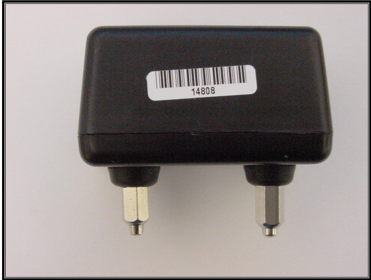
PHOTOGRAPH 14: RECEIVER – SIDE VIEW