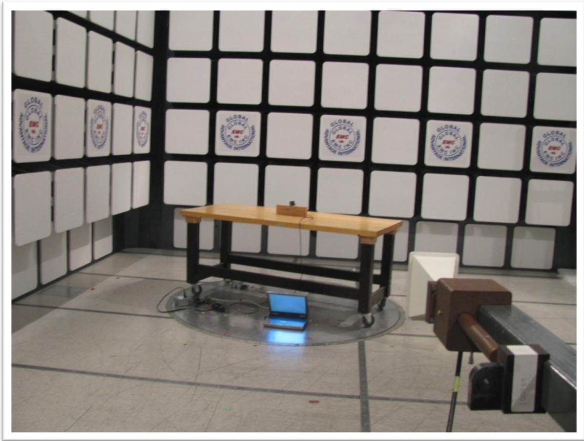
Figure 1 – Radiated emissions testing