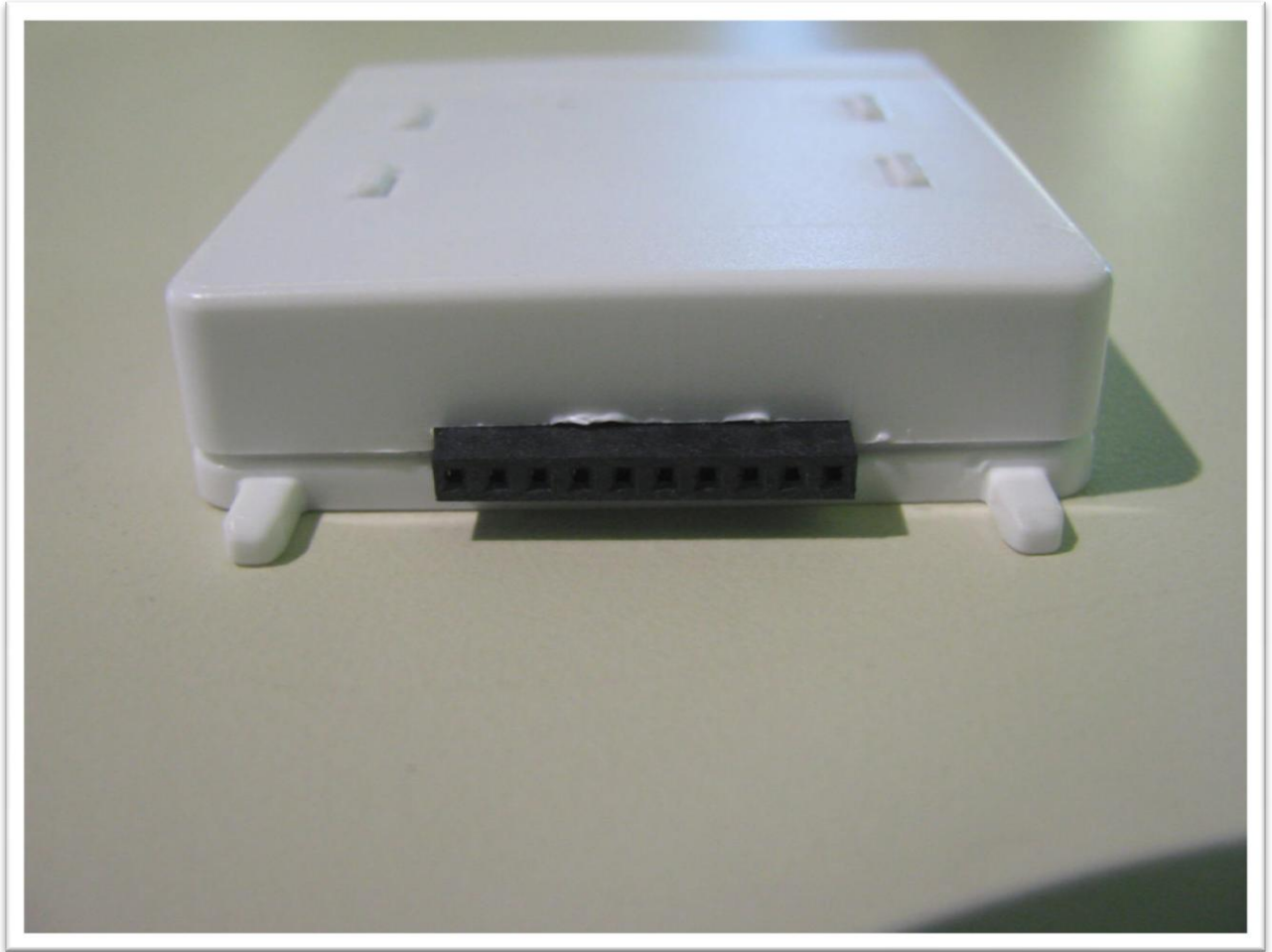
Figure 3 – EUT with cartridge enclosure (Connector)