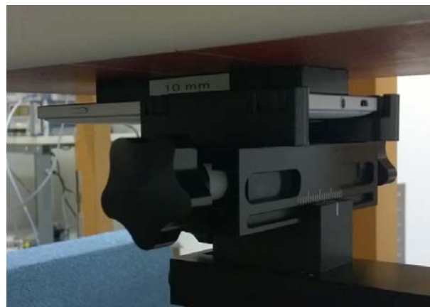
Photo of the device positioned for WR mode measurement – display facing phantom. The spacer was removed before the start of the measurements.