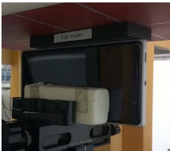
Photo of the device positioned for WR mode measurement – left edge facing phantom. The spacer was removed before the start of the measurements.