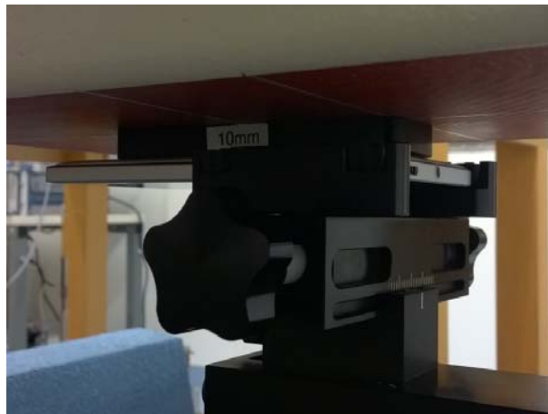
Photo of the device positioned for WR mode measurement –back facing phantom. The spacer was removed before the start of the measurements.

The device was placed in the SPEAG holder using the Microsoft spacer and, in sequence, the back, display and each of the 4 edges was positioned 10.0mm away from the flat phantom. The spacer was removed before the start of the measurements.