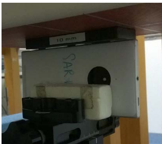
Photo of the device positioned for WR mode measurement – right edge facing phantom. The spacer was removed before the start of the measurements