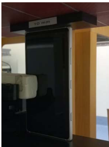
Photo of the device positioned for WR mode measurement – top edge facing phantom. The spacer was removed before the start of the measurements.