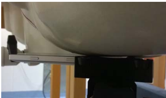
Photo of the Device in "cheek" position

The positions used in the measurements were according to IEEE 1528 "IEEE Recommended Practice for Determining the Peak Spatial-Average Specific Absorption Rate (SAR) in the Human Head from Wireless Communications Devices: Measurement Techniques".