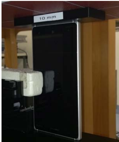
Photo of the device positioned for WR mode measurement – bottom edge facing phantom. The spacer was removed before the start of the measurements.