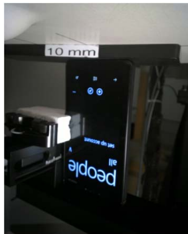
Photo of the device positioned for WR mode measurement – bottom edge facing phantom. The spacer was removed before the start of the measurements.