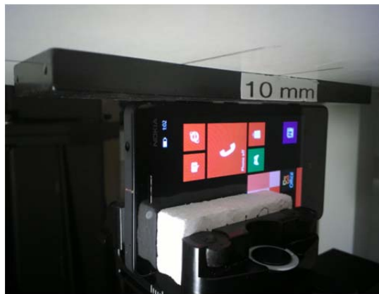
Photo of the device positioned for WR mode measurement – right edge facing phantom. The spacer was removed before the start of the measurements.