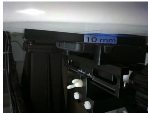
Photo of the device positioned for WR mode measurement – display facing phantom. The spacer was removed before the start of the measurements.