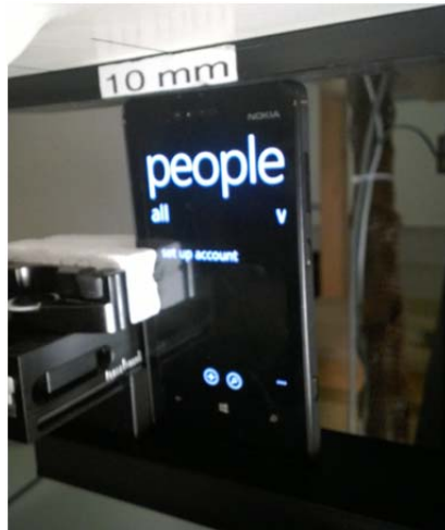
Photo of the device positioned for WR mode measurement – top edge facing phantom. The spacer was removed before the start of the measurements.