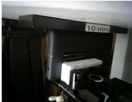
Photo of the device positioned for WR mode measurement – left edge facing phantom. The spacer was removed before the start of the measurements.