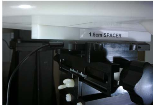
Photo of the device positioned for Body SAR measurement. The spacer was removed for the tests.

The device was placed in the SPEAG holder using the Nokia spacer and placed below the flat section of the phantom. The distance between the device and the phantom was kept at the separation distance indicated in the photo below using a separate flat spacer that was removed before the start of the measurements. The device was oriented with both sides facing the phantom to find the highest results.