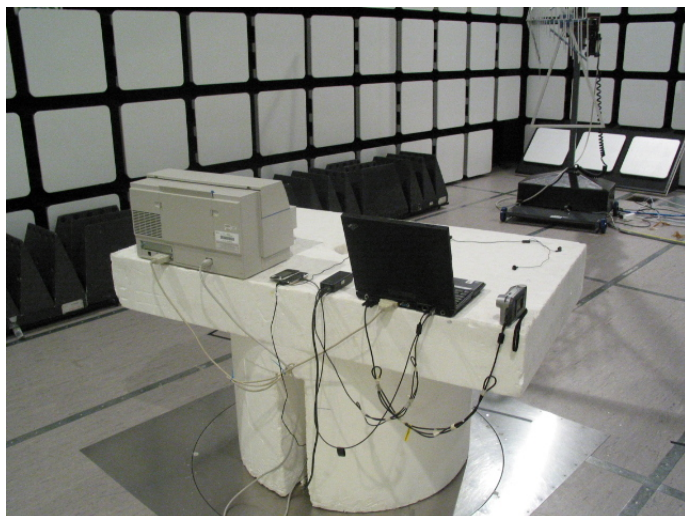
Picture 2 Radiated emission 15B