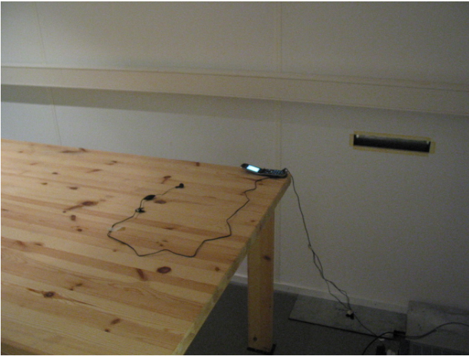
Picture 3 AC powerline conducted emission measurement 15C