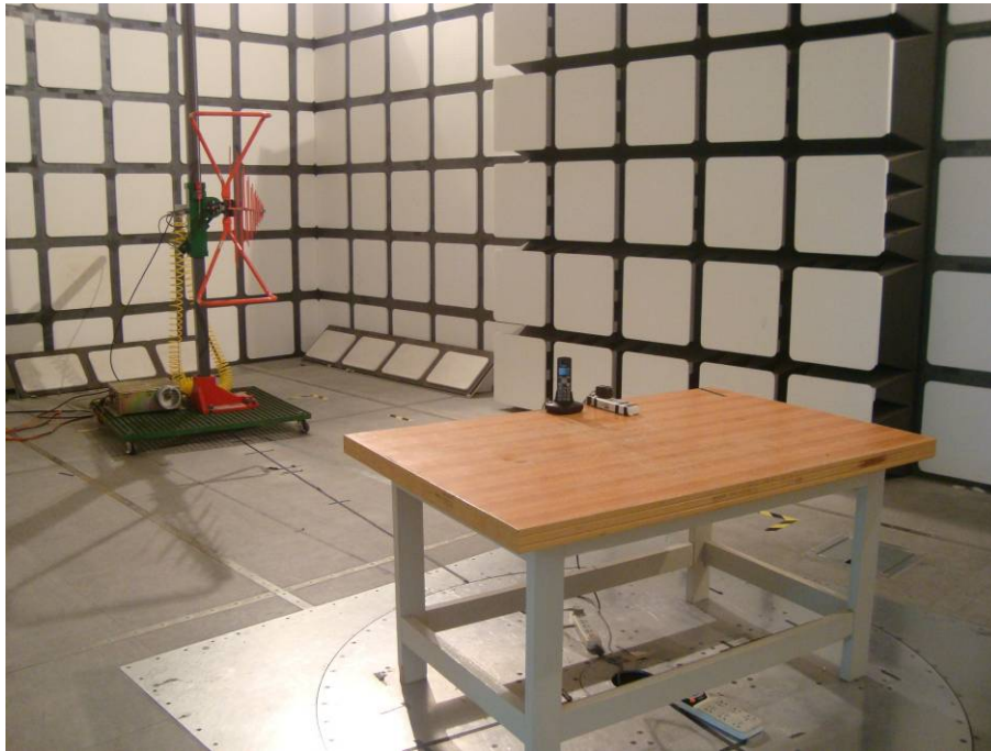
Radiated Emissions - Rear View (30 MHz-1000 MHz, charging mode)