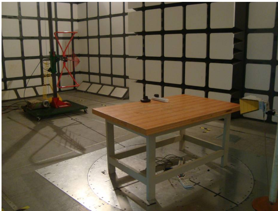
Radiated Emissions - Rear View (30 MHz-1000MHz, transmitting mode)