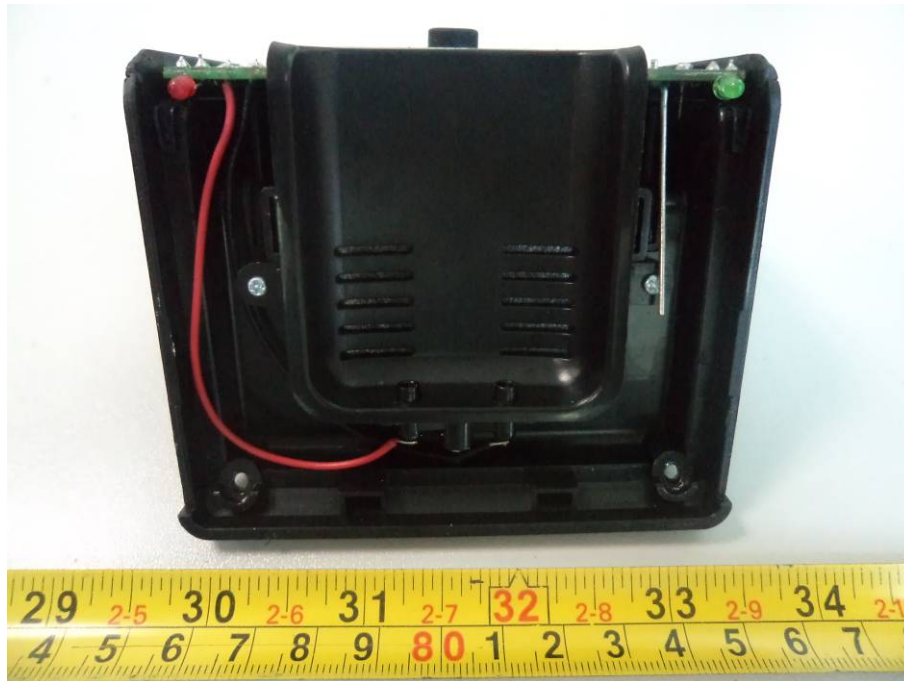
EUT – Bottom Cover off View