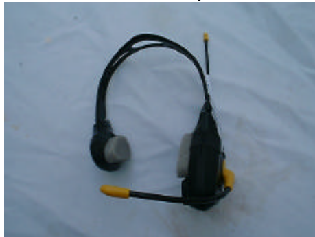
Front View of the product