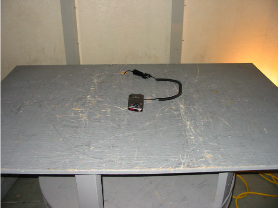
Model: Passport 8500