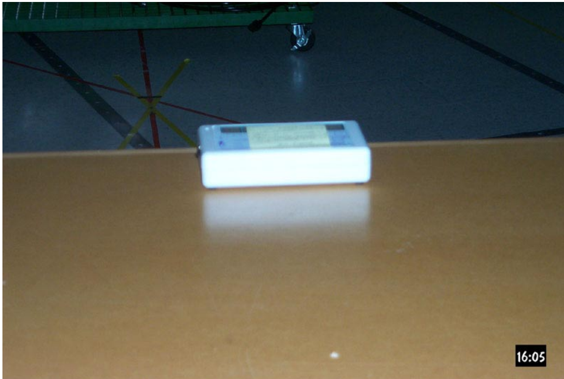
Figure 1 Test setup